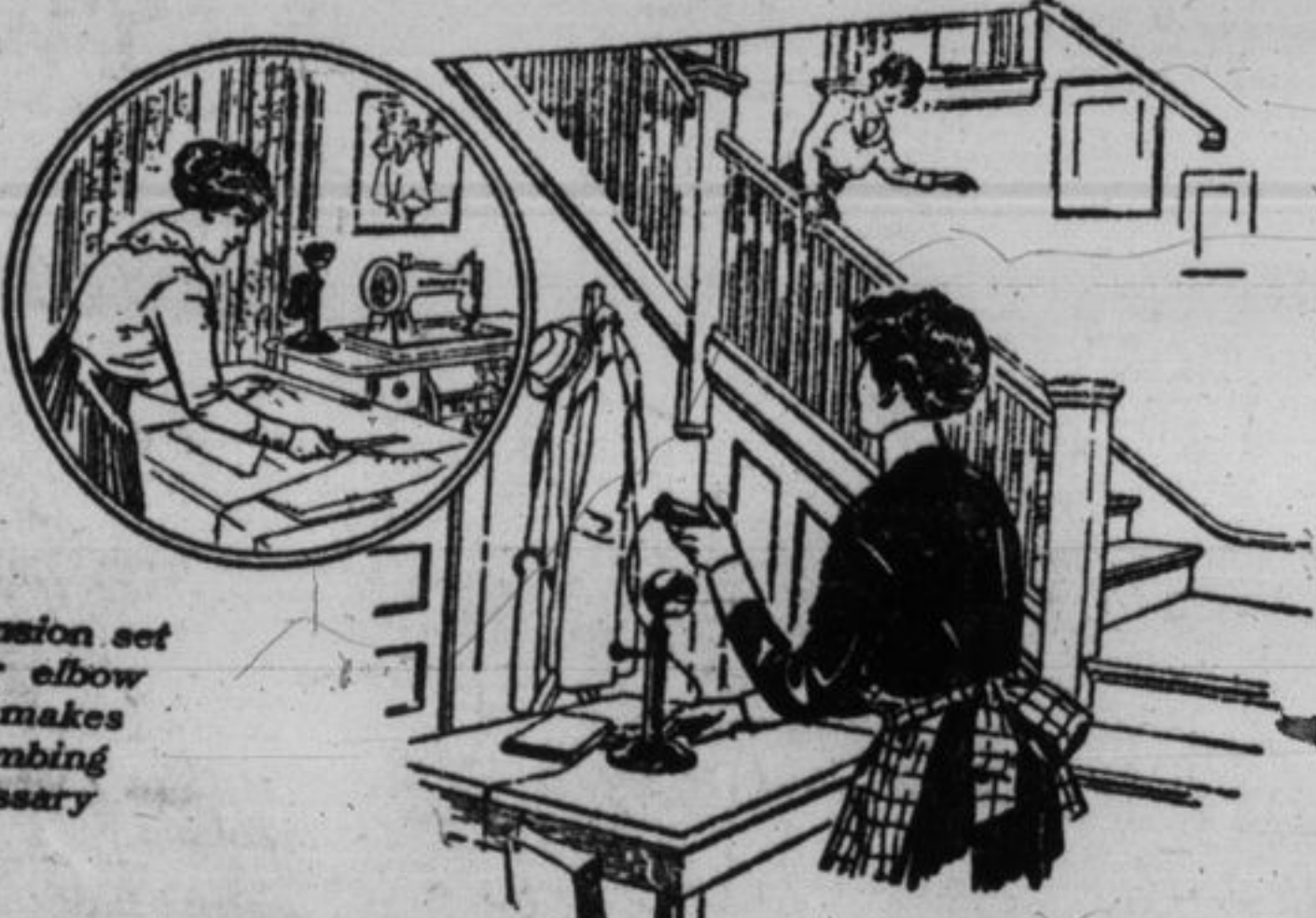
This extension set at your elbow upstairs makes stair climbing unnecessary

Even the fashion czars occasionally have to bow to vox populi. We see they have decided to allow the short skirts to remain in fashion. Hurrah! It takes all kinds of people to make a world, so they say, but we never could see of what earthly use a two-faced person can be.