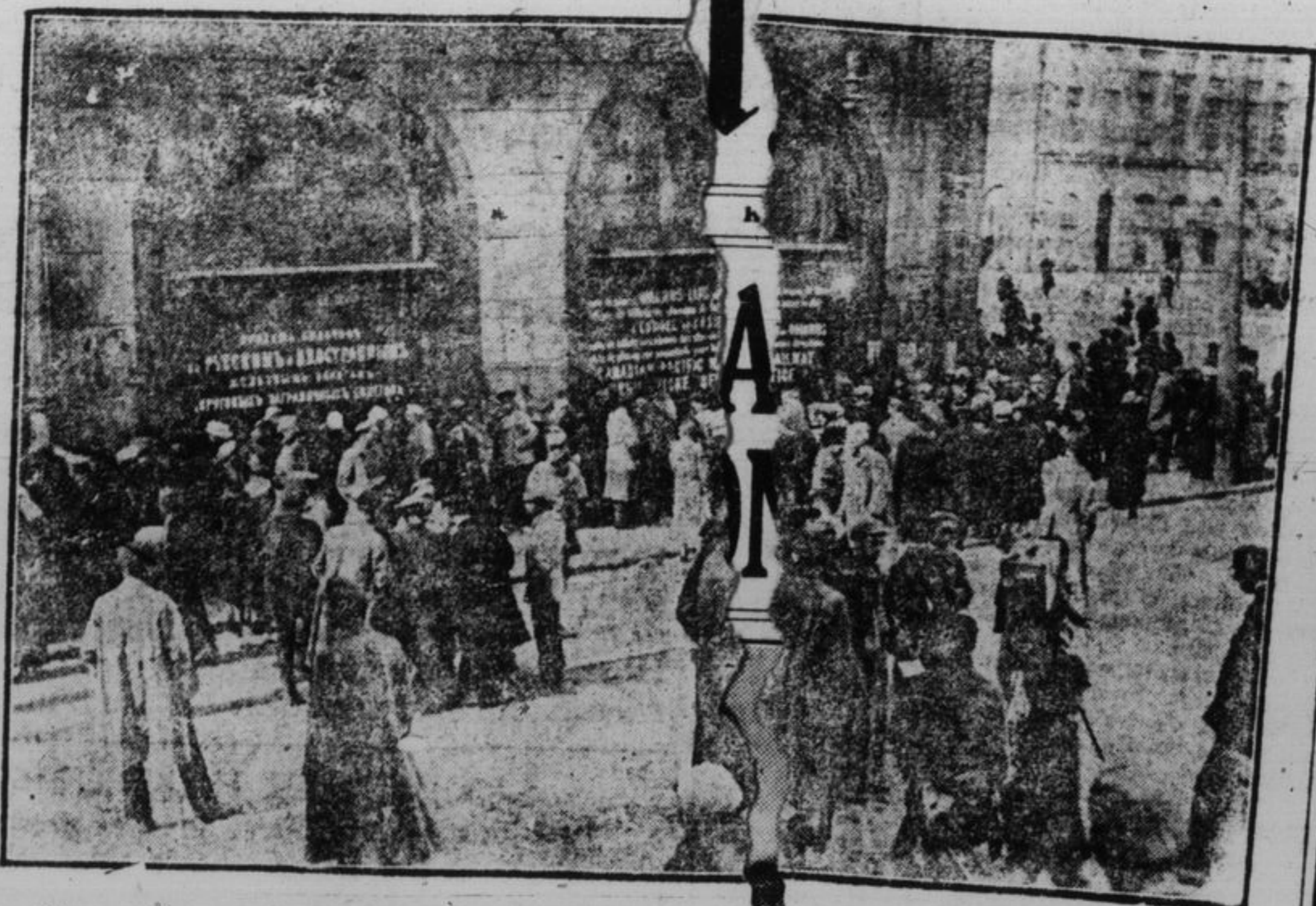
Corner of one of the Moscow railway stations waiting for the ticket office to open so that they may obtain Government tickets, which will permit them to leave the city. Note the Canadian Pacific Railway sign in the window.

'The Dumbells' and Election Returns. Captain Plunkett's world-famous 'Dumbells' will offer their great overseas revue, 'Biff, Bing, Bang' at the Grand tonight and tomorrow matinee and night.