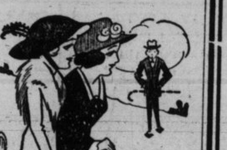
"He thinks he's a particularly bright social light." "Not any longer—he's been turned down."

A lot of times it's mighty hard work to get side-tracked ambition back on the main line.