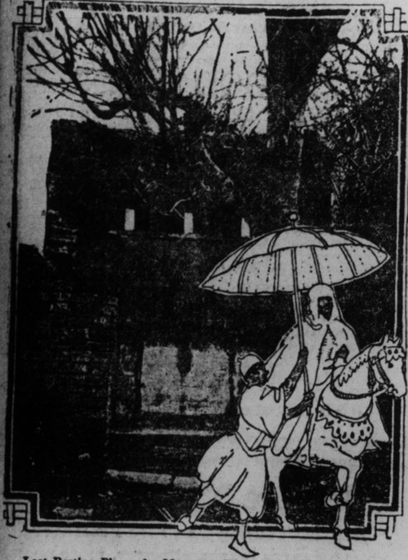
Last Resting Place of a Moroccan King, Most Absolute of All Ancient Monarchs.

THE crumbling last resting place of one of the world's most absolute rulers is being slowly obliterated by the shifting desert sands.