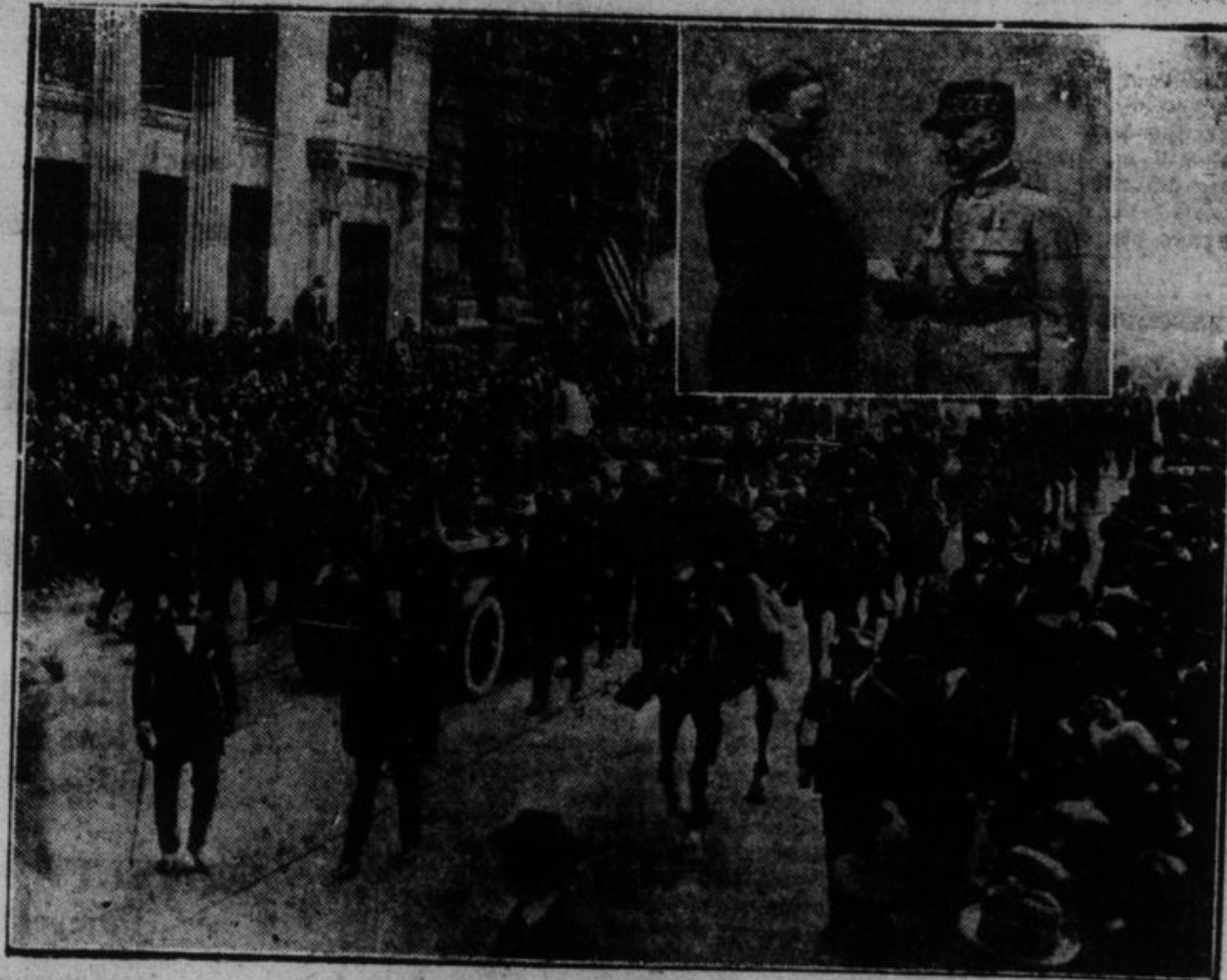
MARSHAL FOCH MAKES TRIUMPHANT ENTRY INTO NEW YORK. The allied generalissimo is here seen being escorted along lower Broadway by New York's finest through crowds of cheering people. Inset are Mayor Hylan and the Marshal shaking hands after the latter had been given the freedom of the city.

ECZEMA you are not expert in treating when you use Dr. Chase's Ointment. It relieves at once and gradually heals the skin. Sample box Dr. Chase's Ointment free if you mention this paper and send 2c. stamp for postage. See a list of all dealers at Publishers, Sales & Co., Montreal, Quebec.