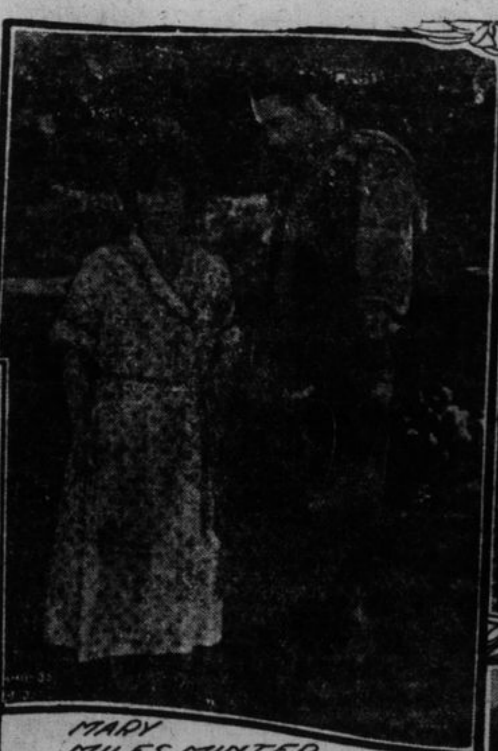
MARY MILES MINTER AND MONTE BLUE IN "MOONLIGHT AND HONEYSUCKLE"