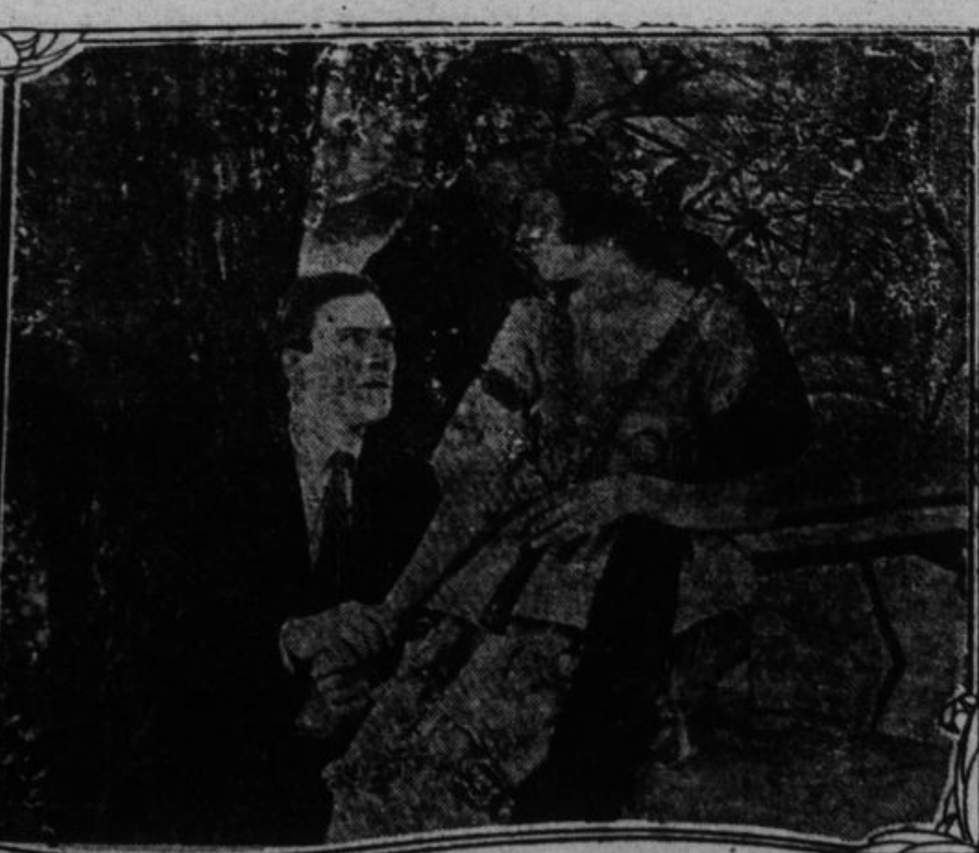
THOMAS MEIGHAN AND DORIS KENYON IN "THE CONQUEST OF CANAAN"