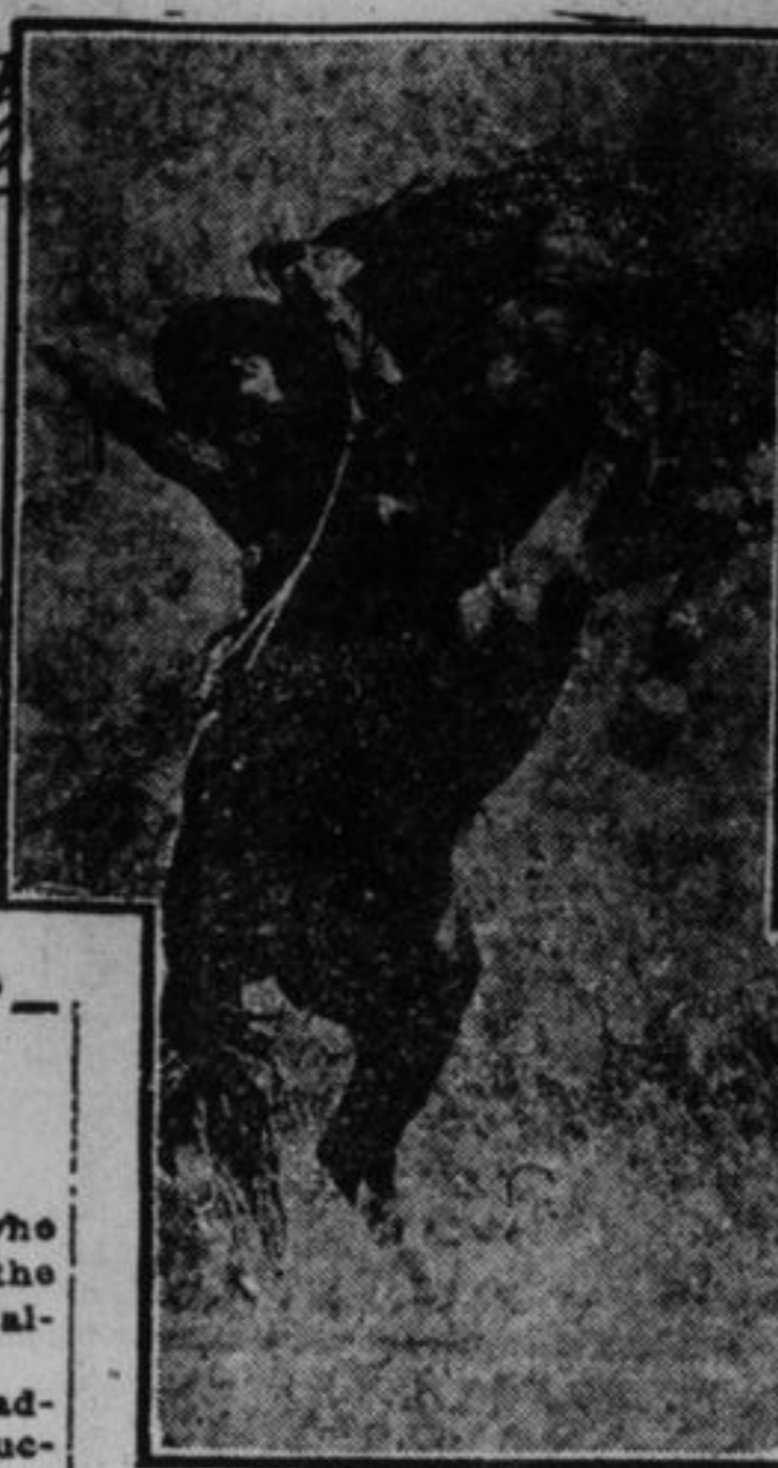
TOM MIX, ONE OF THE FINEST HORSEMEN ON THE SCREEN