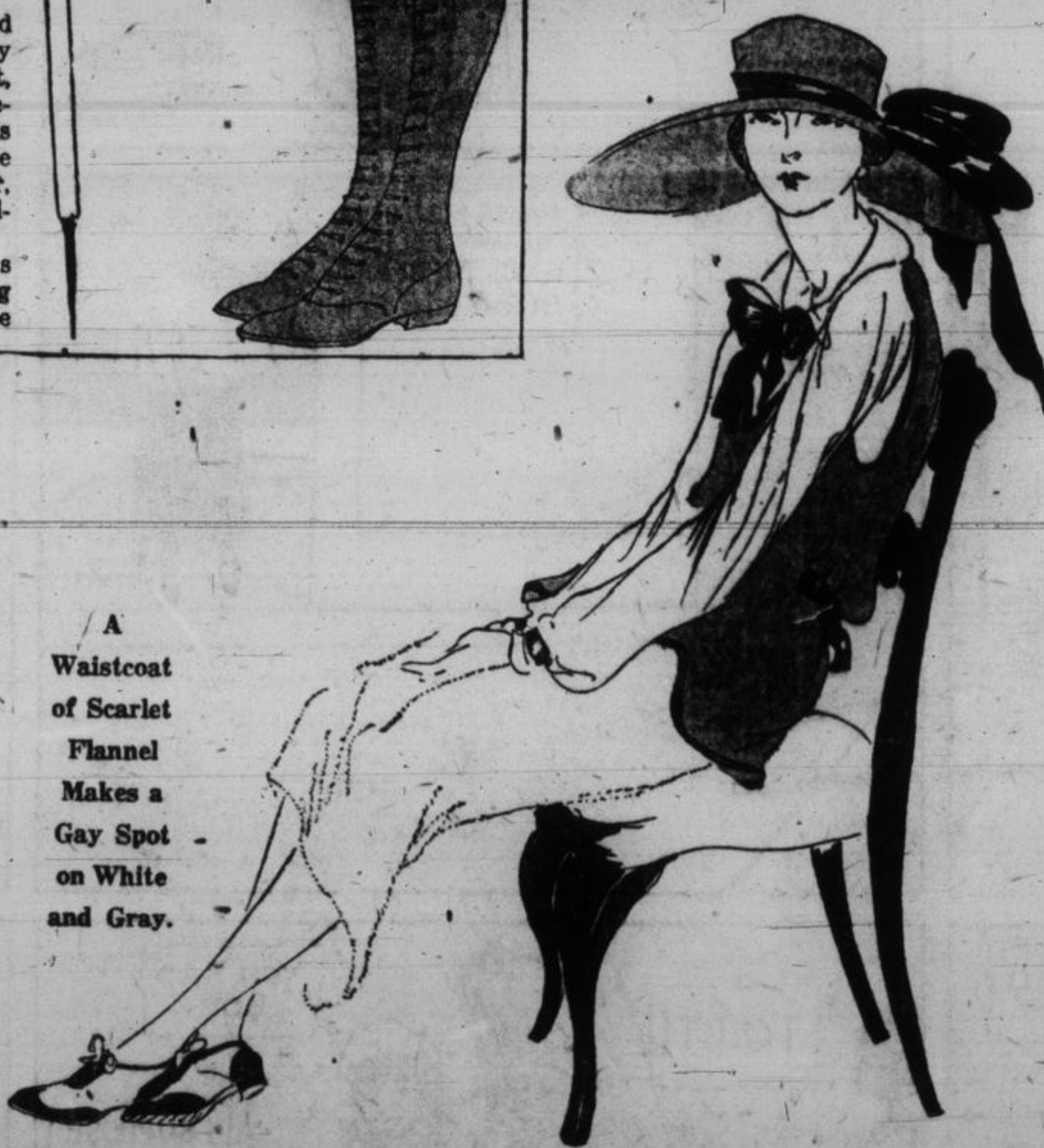
A Waistcoat of Scarlet Flannel Makes a Gay Spot on White and Gray.

Shoes this season are becoming more and more fancied and there are many exquisite color combinations for the woman who sports herself on the links or at the country club. While some women prefer the heavy hand-knitted silk stocking, yet the enthusiastic sportswoman