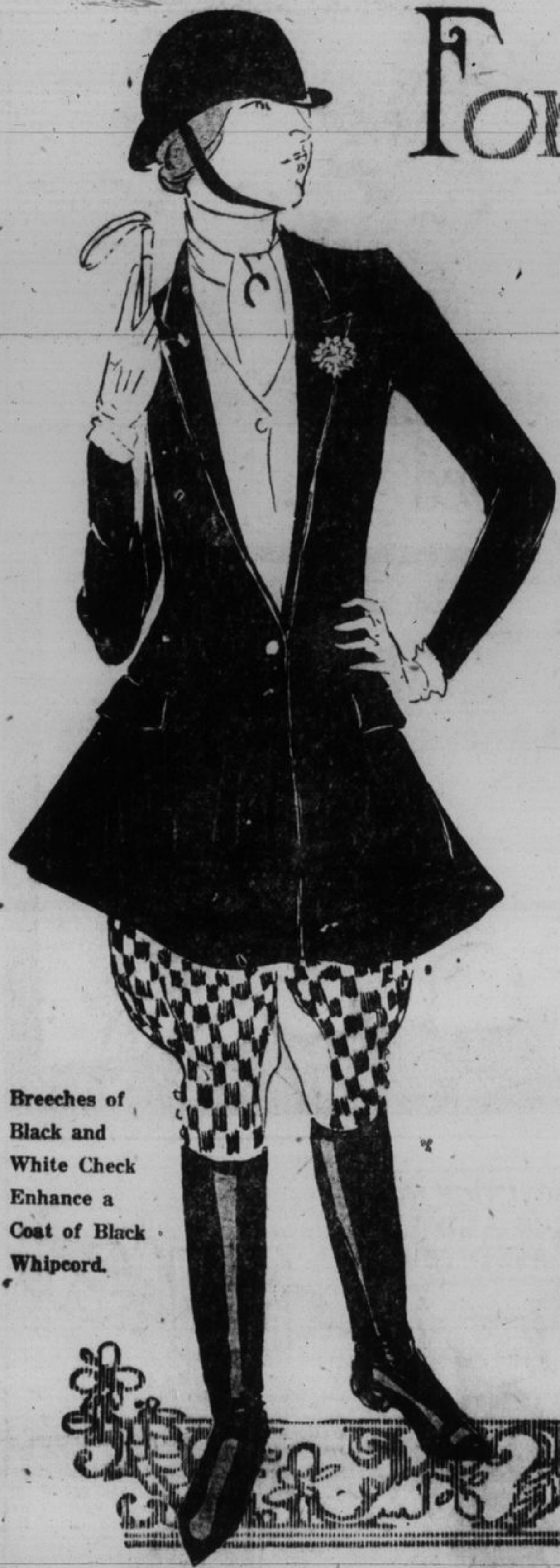
Breeches of Black and White Check Enhance a Coat of Black Whipcord.

Dull Green Plaided in Violet and a Long Warm Scarf of Violet for Golfing Outfit.