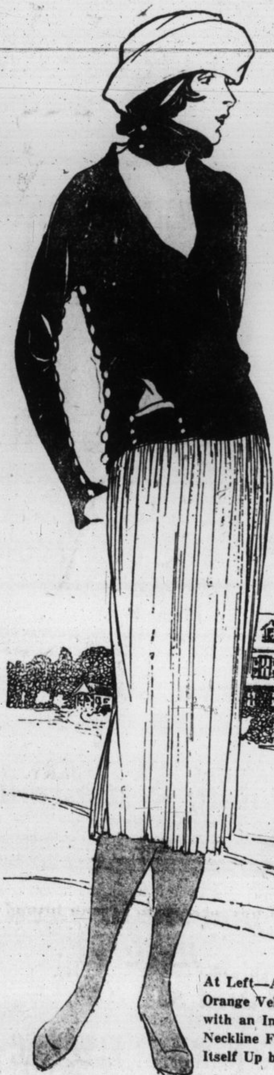
At Left—An Orange Velvet Blouse with an Interesting Neckline Fastens Itself Up by One Sleeve.

Pioneer Effects in the New Fall Designs for the Tournament Girl Who Is Going in for Leather Trimmings, Kid Hats and Warm Flannel Smocks.