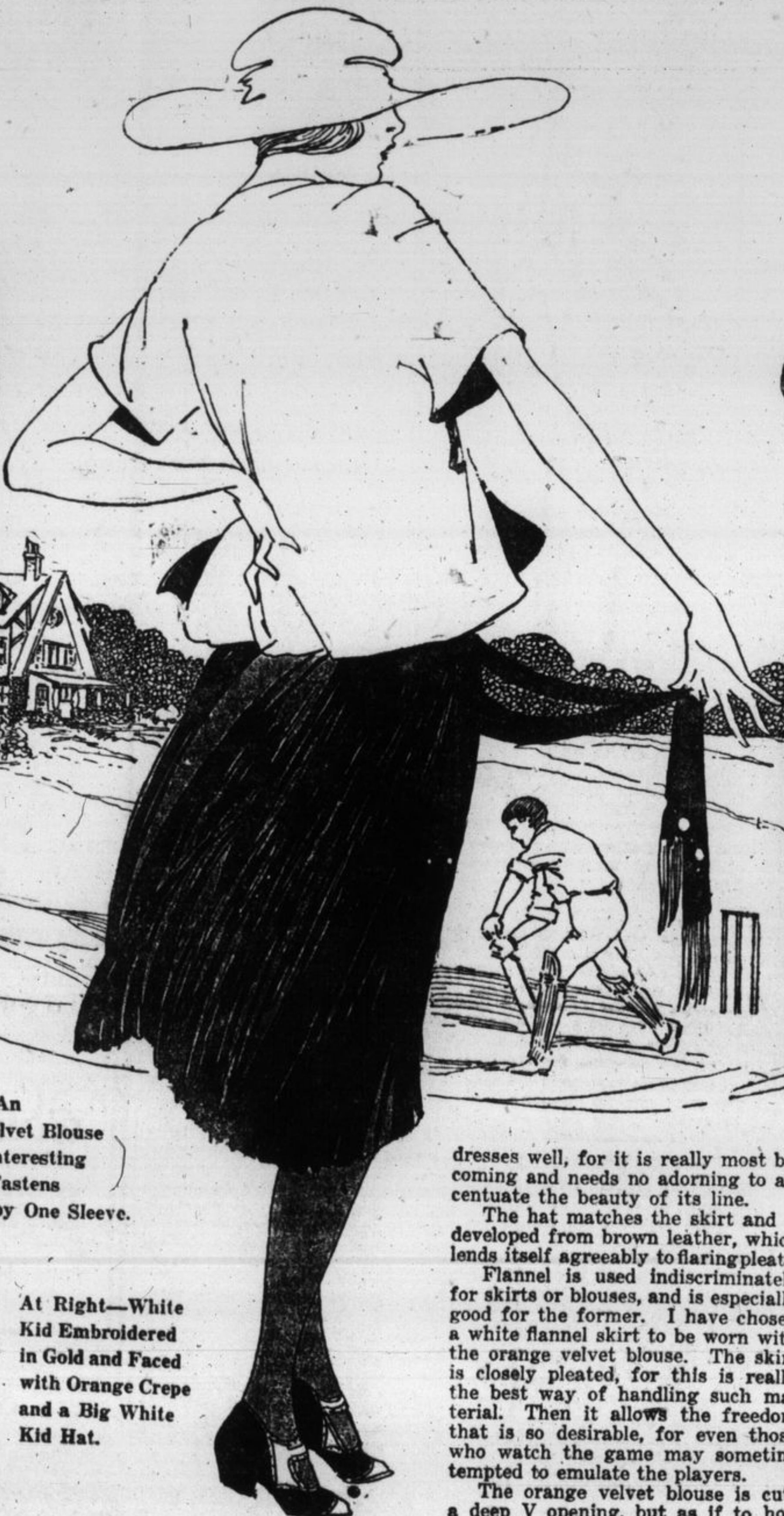
At Right—White Kid Embroidered in Gold and Faced with Orange Crepe and a Big White Kid Hat.