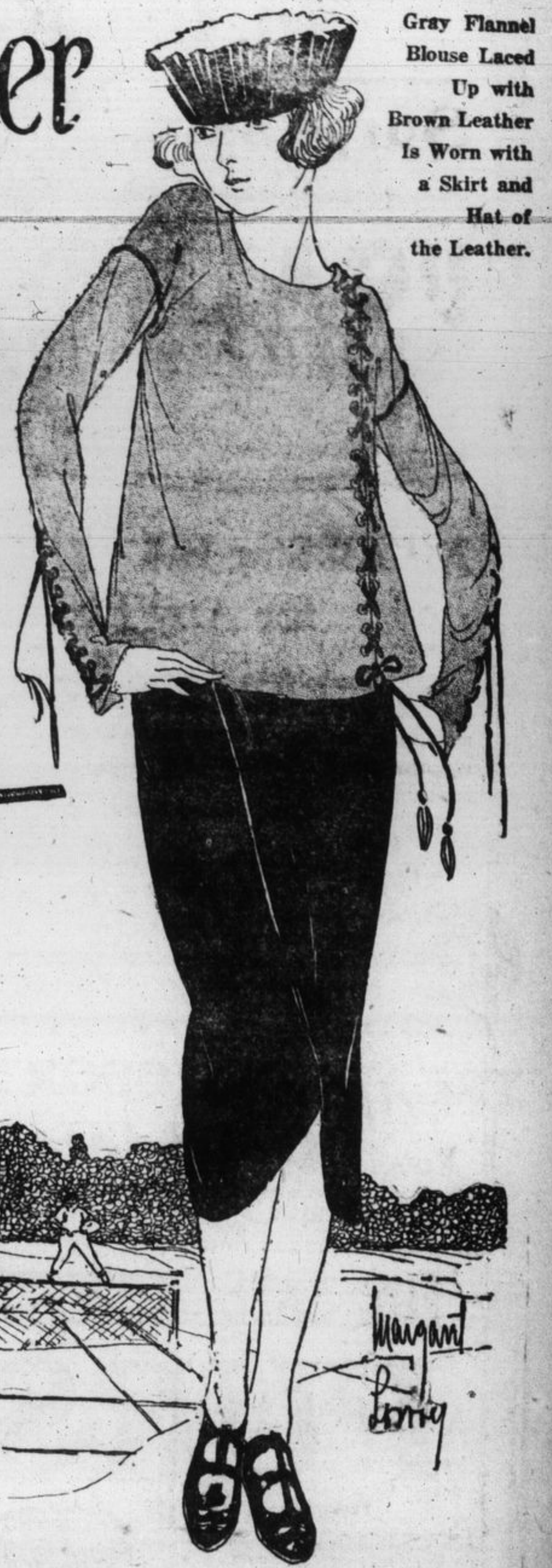
Gray Flannel Blouse Laced Up with Brown Leather Is Worn with a Skirt and Hat of the Leather.