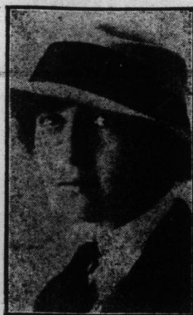
MISS CECIL LEITCH The British and French champion woman golfer, who won the Canadian championship at Ottawa on Saturday last.