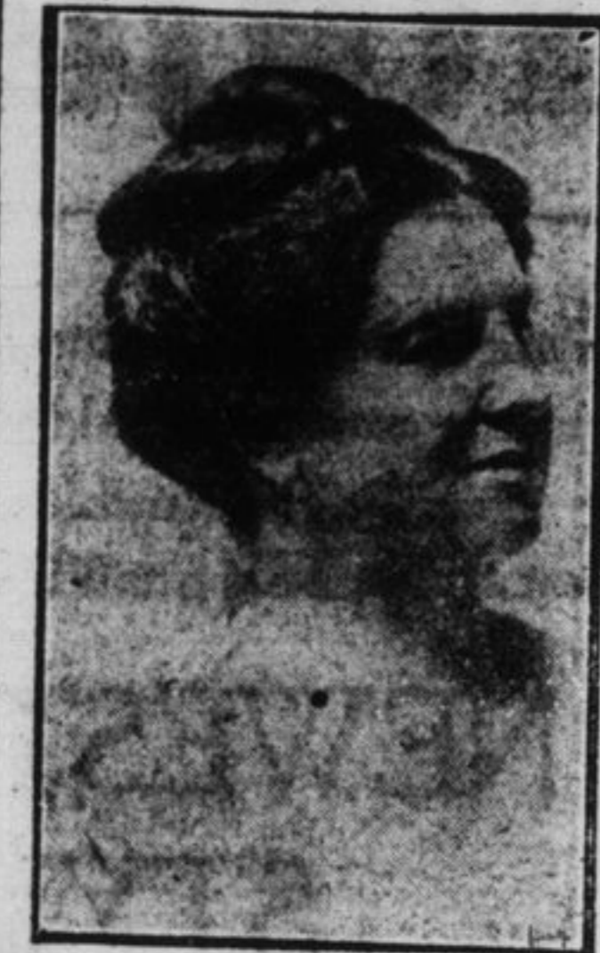
MRS. ARTHUR MURPHY. Whose appointment to the Canadian Senate is urged by women's organizations. Mrs. Murphy is a police magistrate and better known under her pen-name of "Janey Canuck."