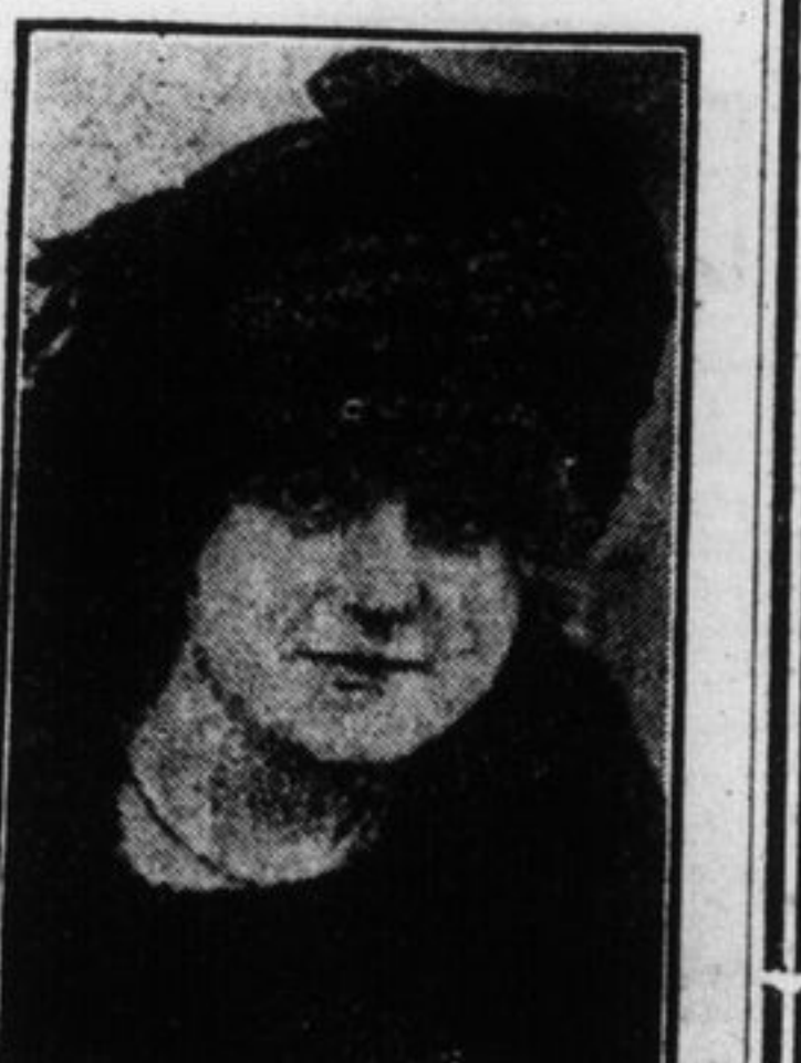
PRINCESS BRAGANZA Duchess of Oporto, who has just left the United States for Naples after placing an order for the largest and most costly bronze and silver casket ever constructed in America, it is to be used for the body of her late husband, a brother of the late King Carlos, of Portugal.