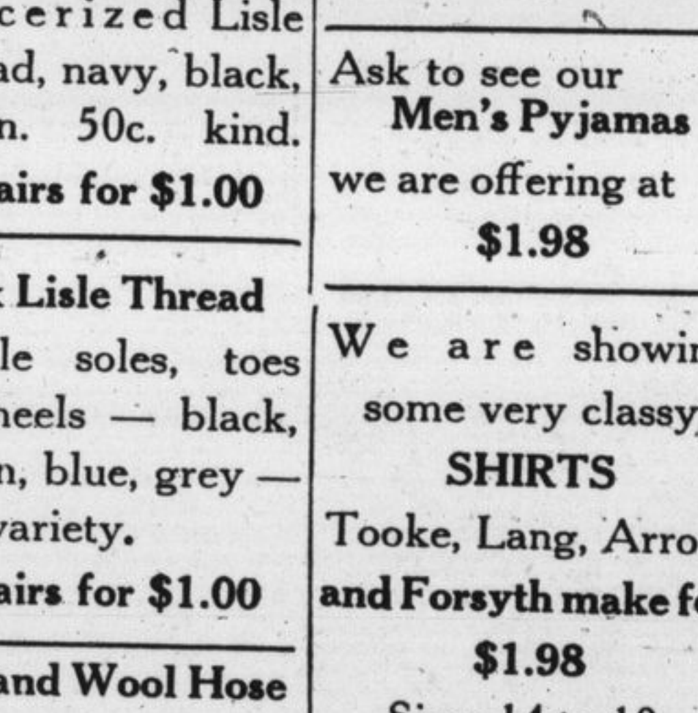
Big Special in Men's Hose. Mercerized Lisle Thread, navy, black, brown. 50c. kind. 3 pairs for $1.00. Silk Lisle Thread Double soles, toes and heels — black, brown, blue, grey — 75c. variety. 2 pairs for $1.00. Silk and Wool Hose Have sold at $1.00 and $1.25—blue, tan and grey for 75c. a pair. Pure Silk Hose Double Soles, Toes and heel, pure Silk, "Holeproof" — sold as high as $1.50 and $1.75. $1.00 per pair. Working Men's Wool Socks Ribbed, grey, sold for 50c. and 65c. 2 Pairs for 75c. Men's Soft Collars All new styles. 25c. each. Boston Silk Garters The 75c ones for 50c.

We want you to see The Fall Overcoats we are offering for $25.00. Pure Wool Grey Chevjots, new models, splendidly tailored.