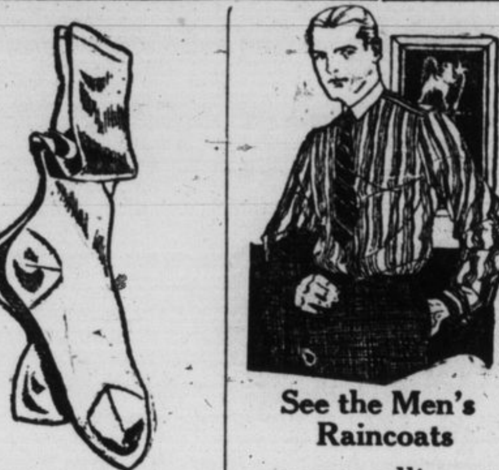
See the Men's Raincoats we are selling at $12.50. You'll be pleased!