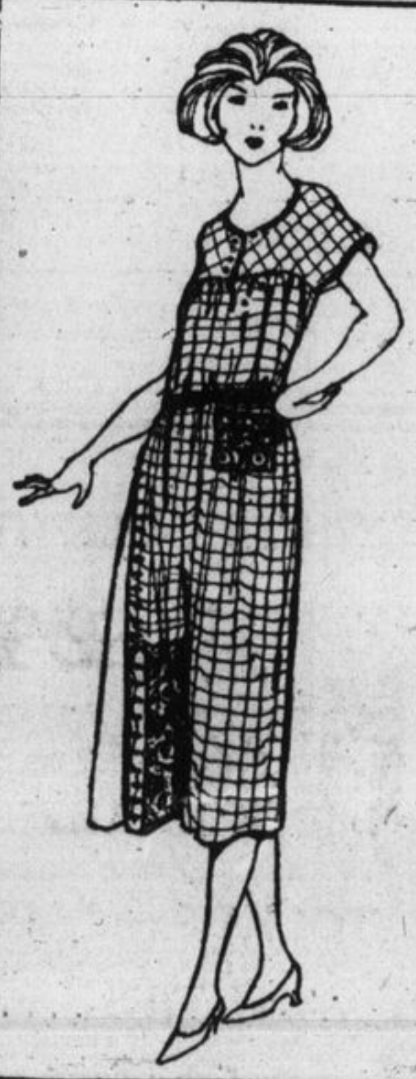
The Simple Gingham Gown.

Gingham parasols and gingham millinery, gingham neckwear and gingham vestees are all among the spring showings, and one finds gingham introduced as trimming on many smart tricotine gowns just now. Blouses