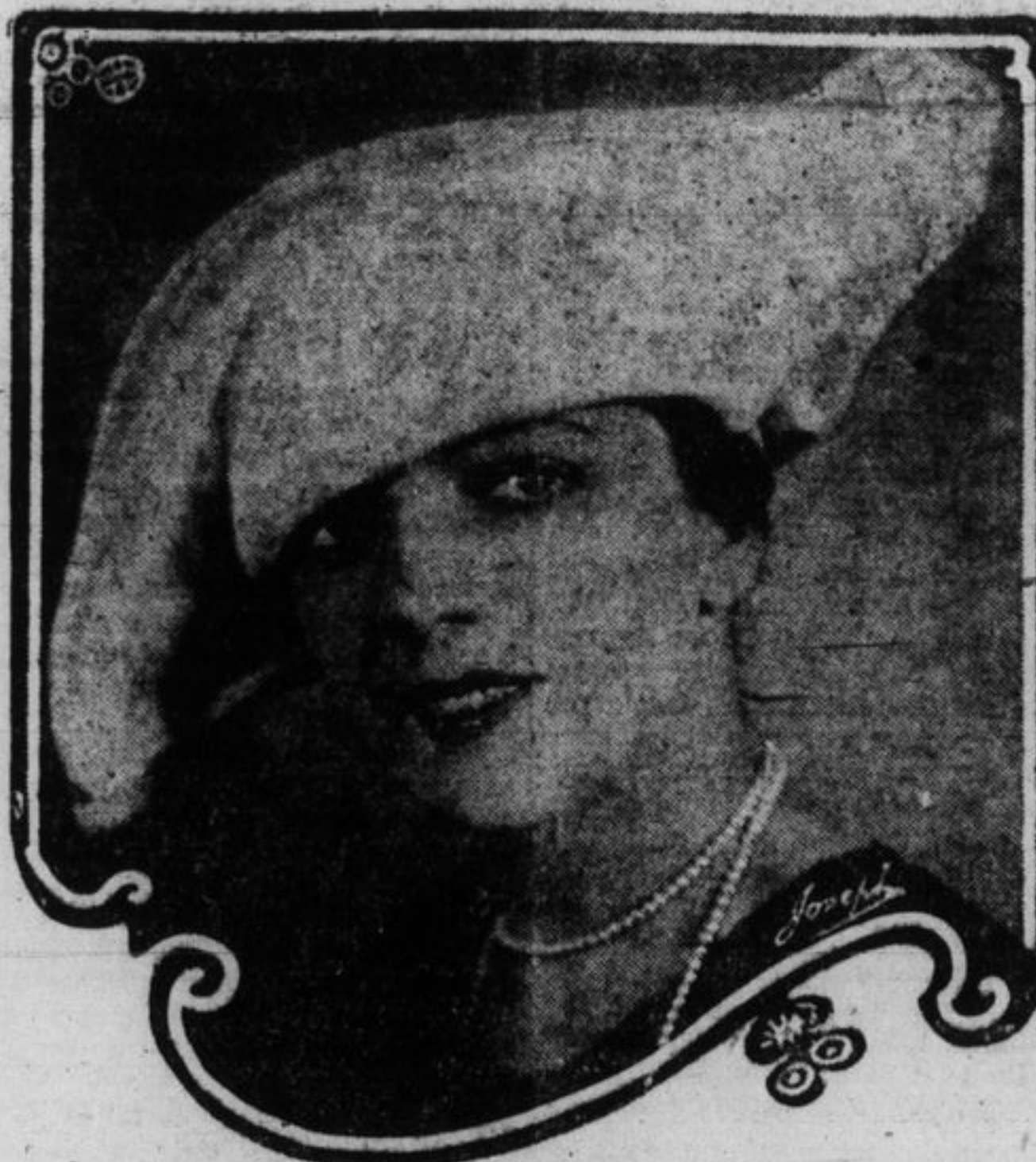
Vacation turbans of white canton crepe combined with white moire ribbon. Joseph names this chapeau the "Go Getter". Mere man may not suspect but "every woman knows" that millinery and matrimony go hand in hand.