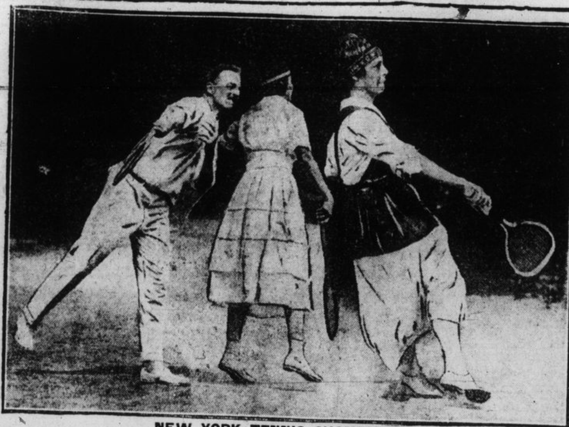
NEW YORK TENNIS CHAMPIONS.