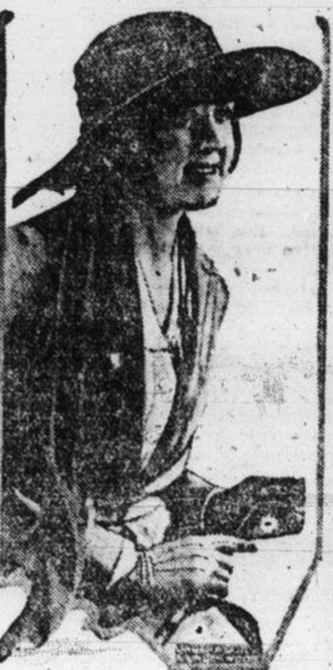
A large chapeau of navy hemp is faced with crepe de chine of the same shade which also adds softness to this straw hat.

Try the savings bank, my friend, if your trousers pockets will not hold your money.