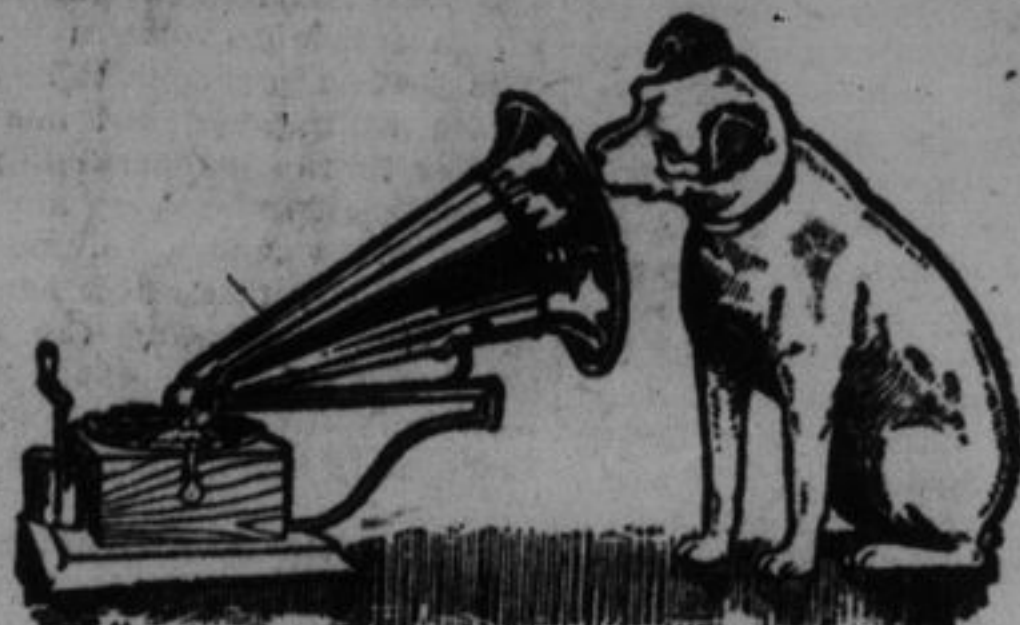
HIS MASTER'S VOICE

JOHN McKAY, Ltd. THE FUR HOUSE 149 to 157 BROCK STREET