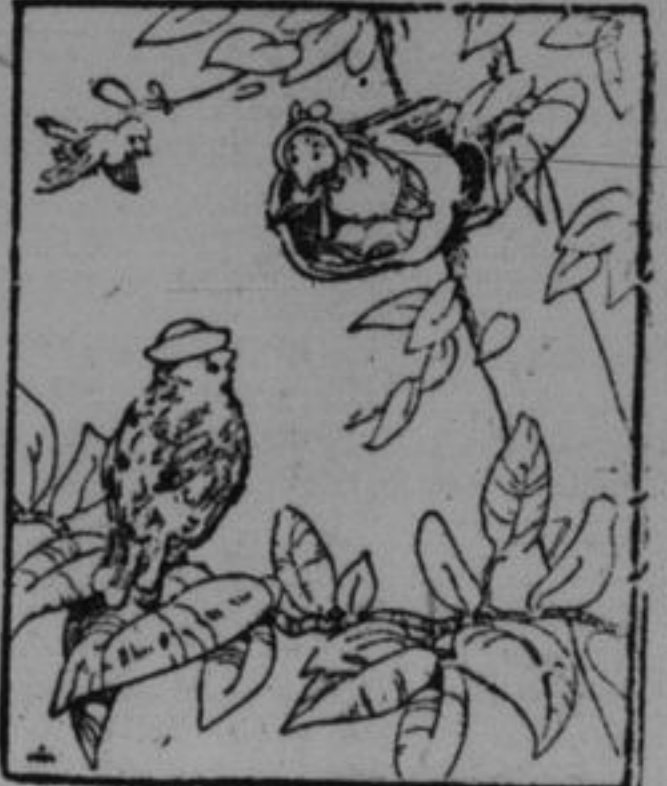
An Interesting Conversation.

"And he is rather a nifty-looking fellow, too," chirped Mrs. Cowbird. "My mate can't sing so very well, but, my goodness he is for ever trying