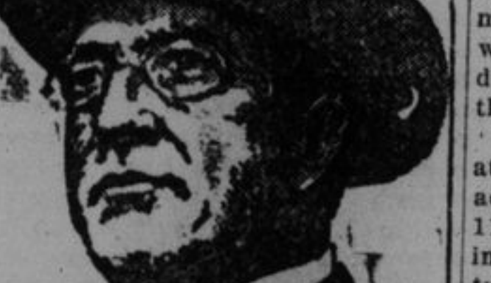
SAMUEL GOMPERS, president of the American Federation of Labor.

Denver, Col., June 23.—The John L. Lewis boom for the presidency of the American Federation of Labor to-day took a slump.