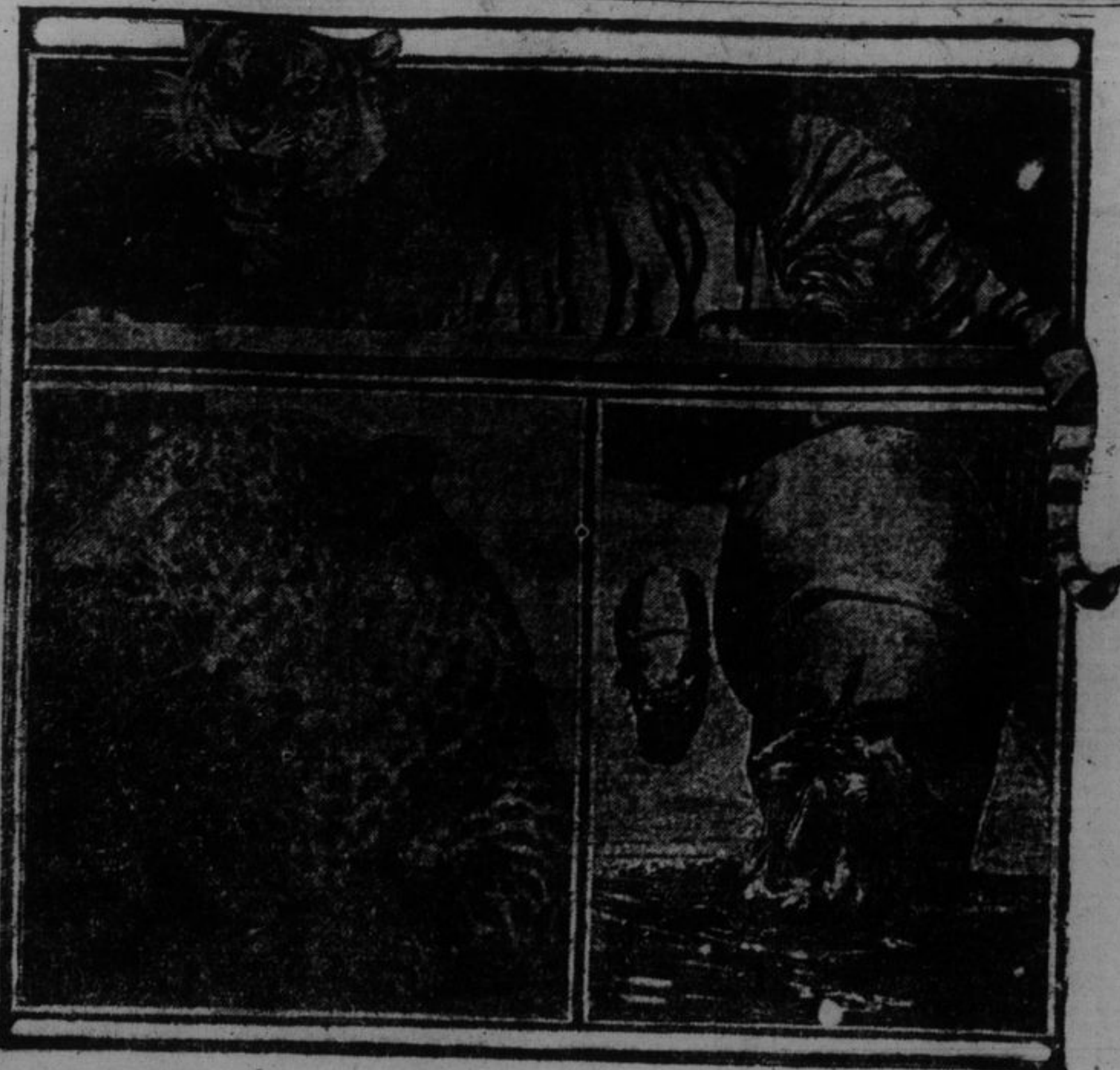
An interesting group of animals with John Robinson Circus, which comes here for two performances on Saturday, June 11th. The John Robinson Circus has always paid great attention to his zoological displays.