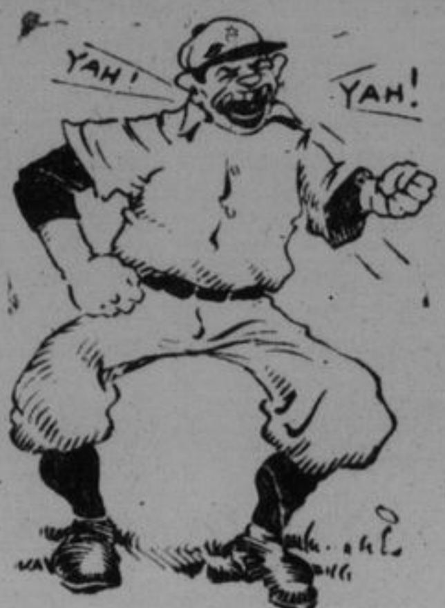
That lively second baseman.

The largest crowd of fans seen on the cricket field this year turned out last evening at six o'clock to see Ponies toy with the Ottawa Senators in the game which was scheduled for the Fair Grounds but was delayed by the rain and held at the cricket field at six o'clock. The final score was 7 to 3 for the Ponies but they could easily have made it much larger. The