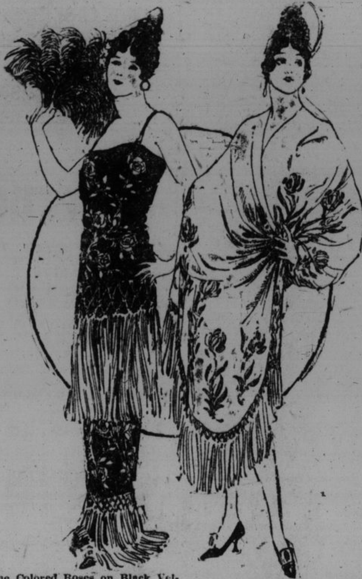
Flame Colored Roses on Black Velvet and Jeweled Fringe Make this Evening Frock.

Castilian Shawls and Some Dresses Show Vivid Trend.