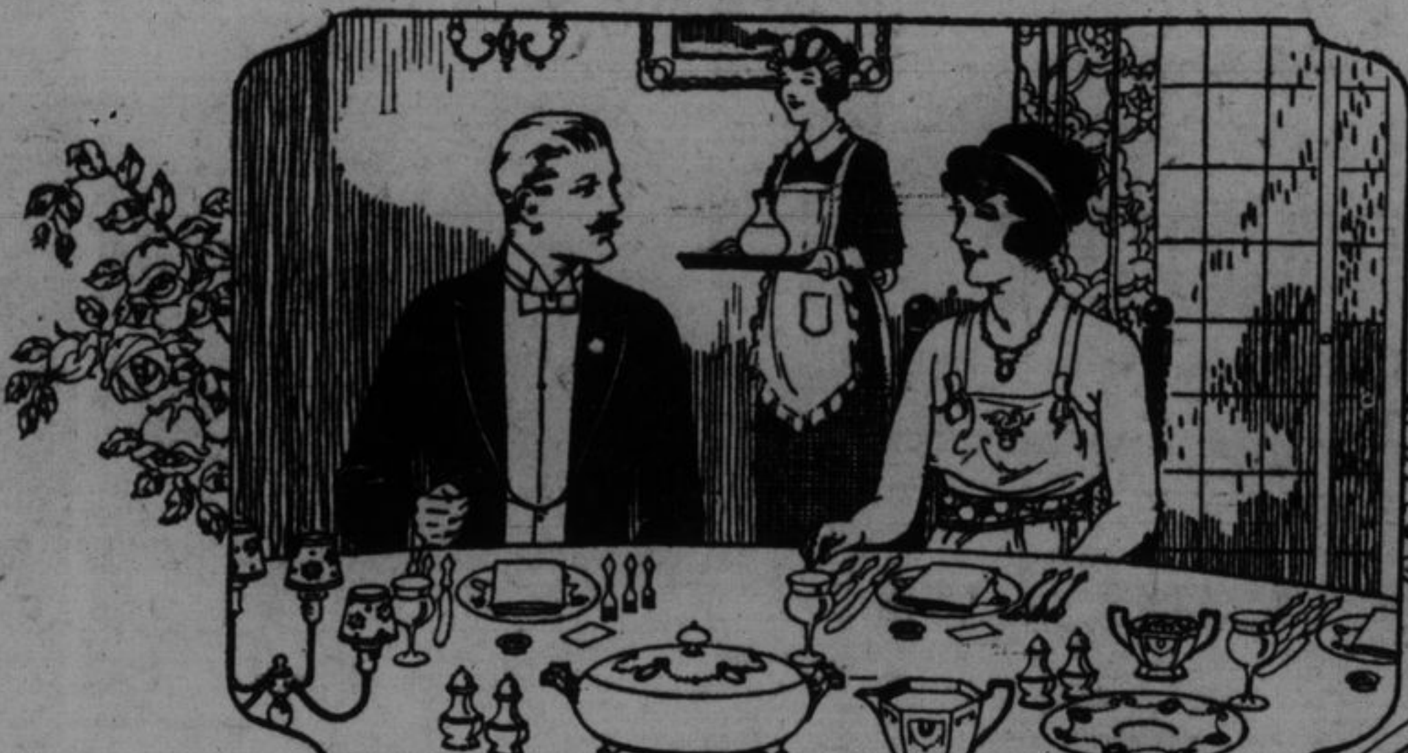
Table Appointments of Gleaming Beauty and Fascinating Design

MIRROR-LIKE in its depth of lustrous silver, "Holmes & Edwards" silverware sheds a fascinating radiance, making any table setting more brilliant and inviting.