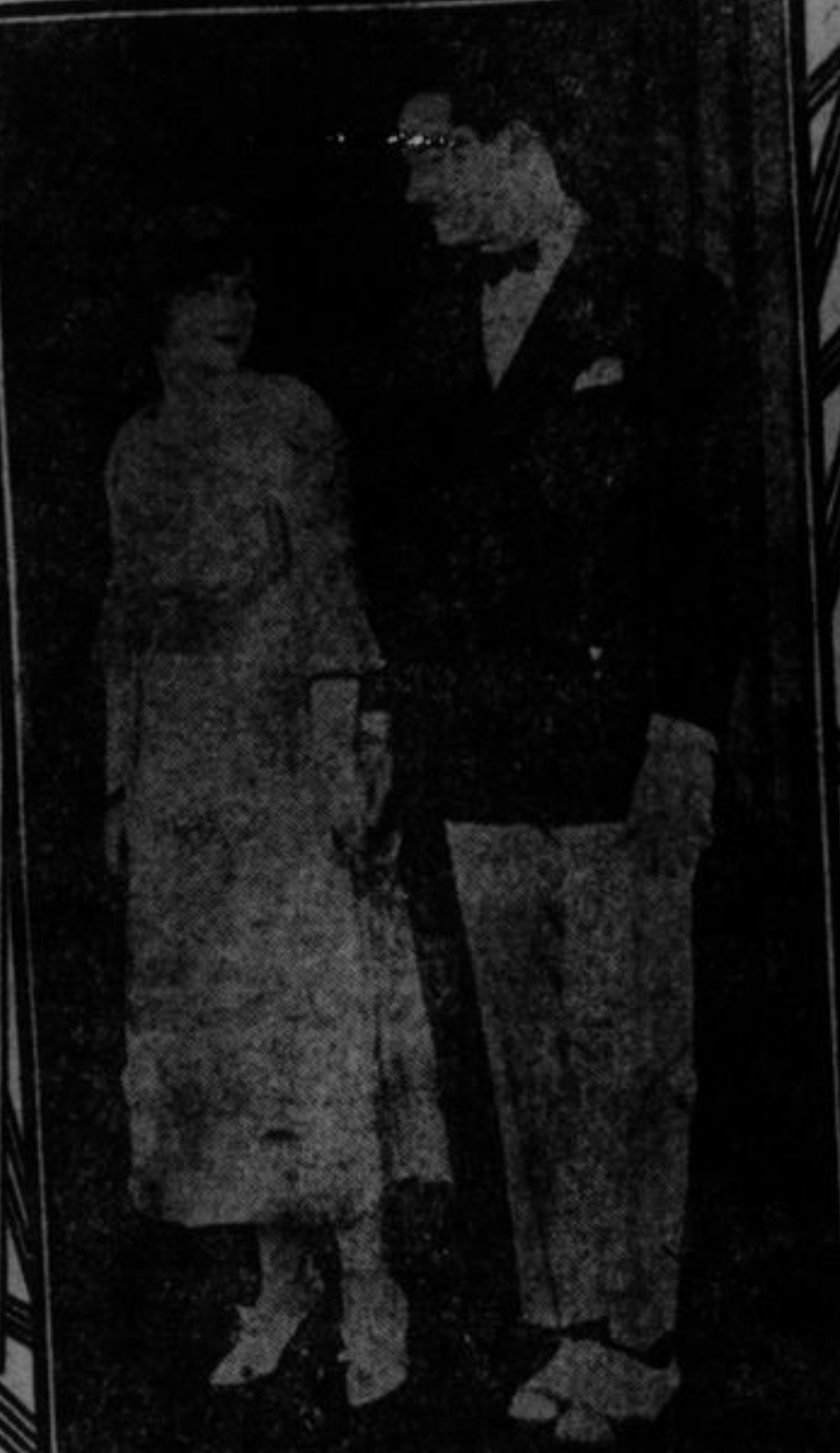
Marion Davies and Norman Kerry in "Buried Treasure"

Armud seized Nomis and carried her off to his palace. She drowned herself in a lily pool and Sheba swore to avenge her sister, and lay the usurper low.