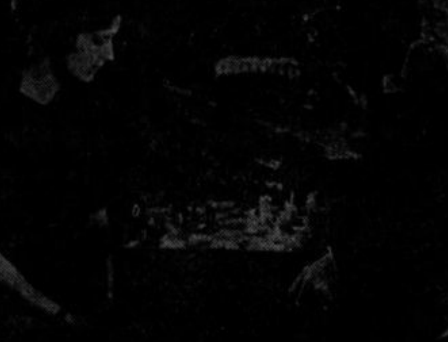
Alice Calhoun and Charles Kent in "The Charming Deceiver"