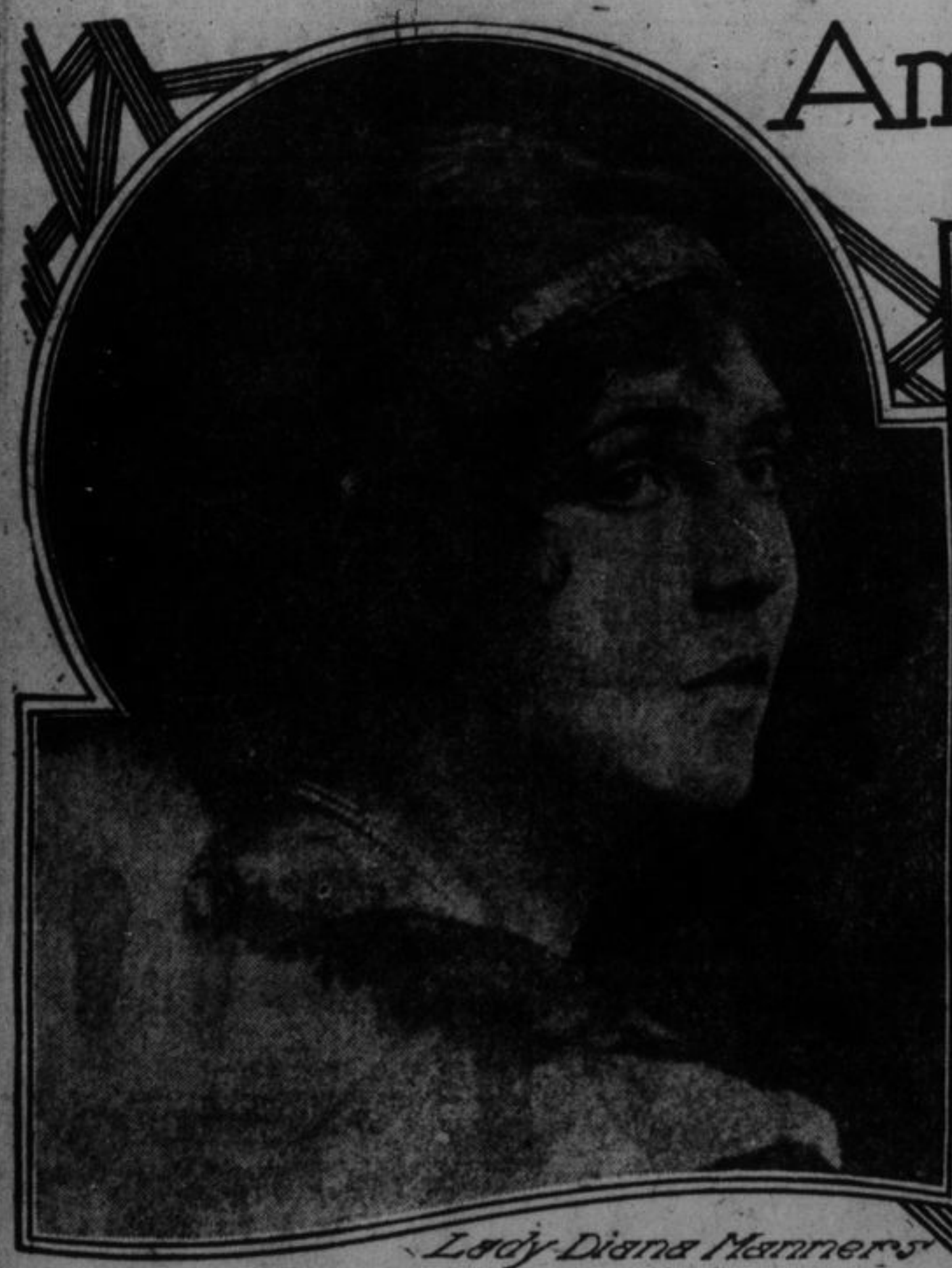
Lady Diana Manners

A Star from Nobility—"Buried Treasure"—Alice Calhoun—"Queen of Sheba"—A Managing Star—"Passion Flower"—A Prize Beauty.