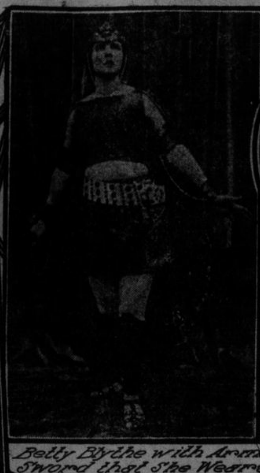
Betty Blythe with armor and sword that she wears in "Queen of Sheba"

When the little prince was five years old he was sent, as an envoy to Solomon. The traitor Adonijah saw in the boy a new peril to his plans.