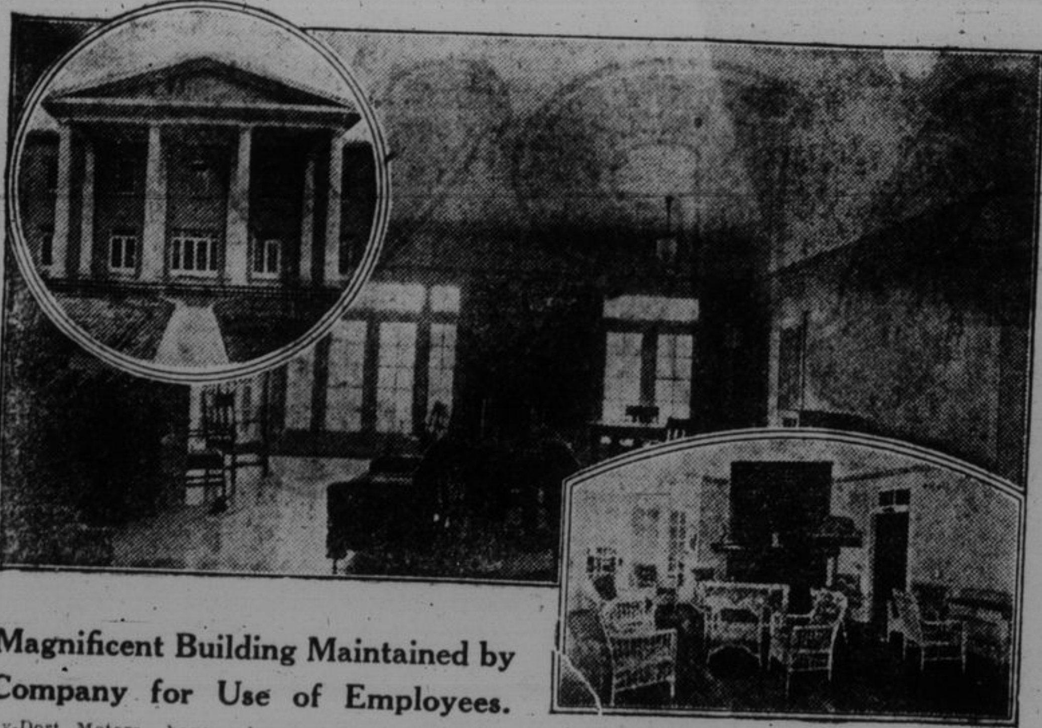
Magnificent Building Maintained by Company for Use of Employees.

Gray-Dort Motors have always been foremost in consideration of the welfare of their employees—not only in factory life—but by means of bonuses, the insurance, the formation of a work's council and other features. Now, however, they are taking a more vital interest in the lives of their employees apart from factory life, and in order to accomplish this, a magnificent building has been outfitted and is maintained by the company for the use of their employees, their families and their friends.