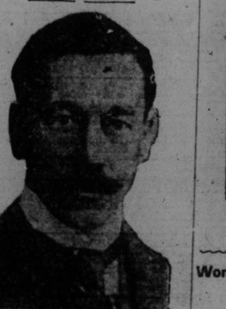
SIR HERBERT SAMUELS British High Commissioner for Palestine, who has taken steps for the protection of the Holy Sepulchre against fire.