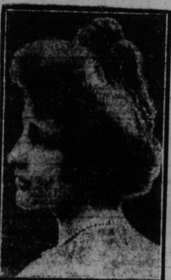
LADY NANCY ASTOR British M. P., who is active in the prohibition campaign in the Old Land.