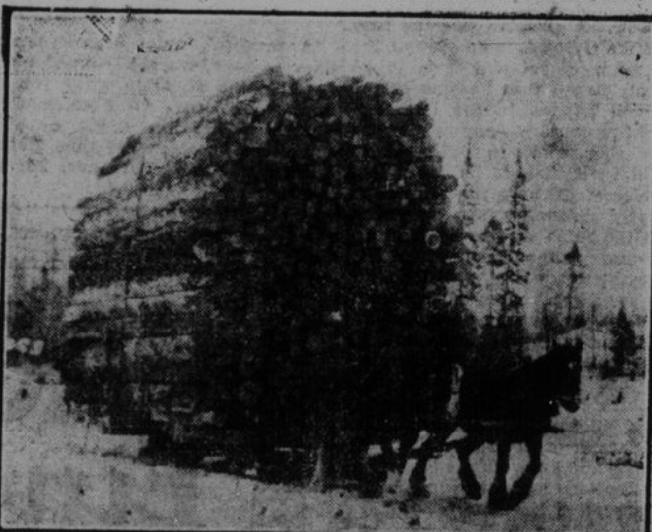
HOW'S THIS FOR A LOAD OF LOGS? There are 306 logs on this load, which is twelve feet wide and fifteen feet high, photographed at Camp 7, McFadden & Mulloy, Dean Lake, Ont.