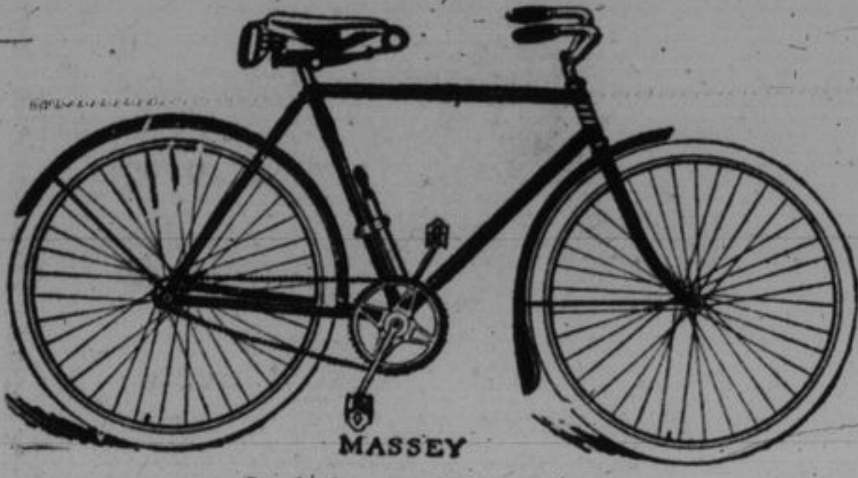
Look for the Silver Ribbon

The Best Bicycle for your money is the MASSEY.