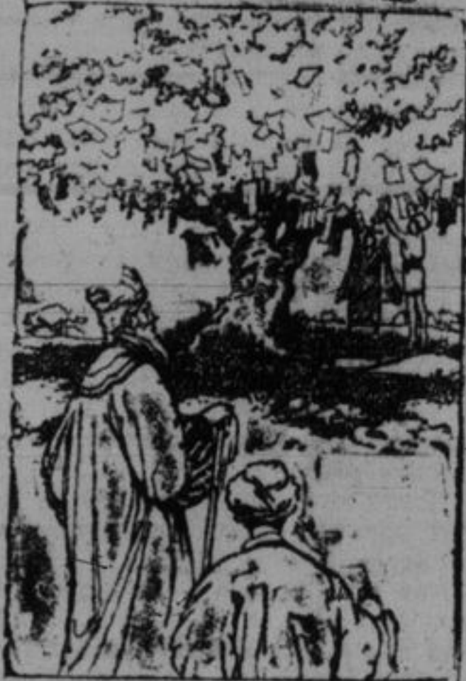
A Marabout Tree.

During his lifetime a Marabout is believed to be a worker of miracles.