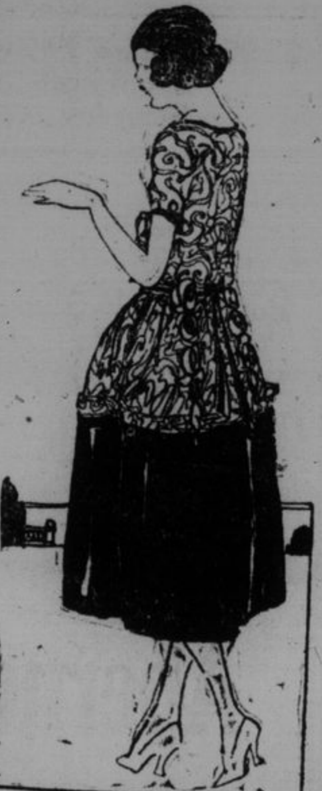
Green Taffeta Combined With Embroidered Green Swiss Makes This Unusual Frock.

"I'd like to see some pretty frocks for daytime wear," she announced as Madame met her. "Very well," replied Madame.