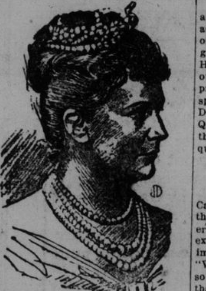
THE LATE GERMAN EMPRESS Who died at Doorn, Holland, at 6 o'clock Monday morning.