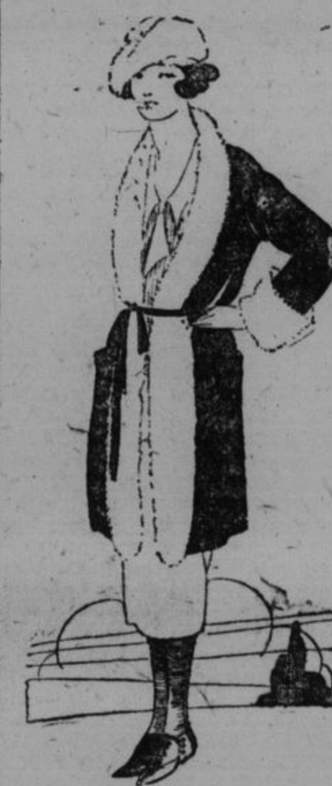
This Sport Coat of Tangerine Polo Cloth is Trimmed With Wool.

The sport coat that is light in weight and gay in color is a highly favored addition to the spring wardrobe. This origination is made of polo cloth in the new shade of fangerine. Simple in style, it possesses that swagger look which is demanded in the modish coat for outdoor wear. The sleeves, which are set in raglan manner, are designed with very wide cuffs.