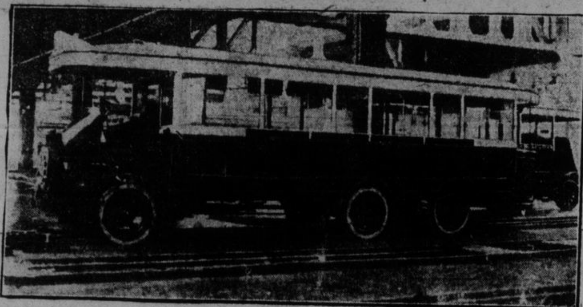
NEW MOTOR BUS SOLVES PARIS TRANSPORTATION PROBLEM. A new type of motor bus, much larger than the type formerly used, has been placed in operation by a Paris transportation company. A fleet of the machines, supported by six wheels, have been placed in commission. A special permit to use the six-wheel motor cars on the Paris streets had to be obtained from the Prefect of Police. The photograph shows several of the big machines at a depot.

His will. The colony was supposed to till the soil, which it was thought would provide sufficient food for its needs. The irrigation was poor and the colony failed.