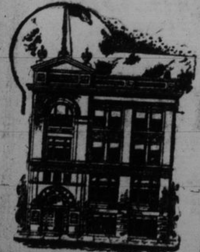
Published Daily and Semi-Weekly by THE BRITISH WHIG PUBLISHING CO., LIMITED