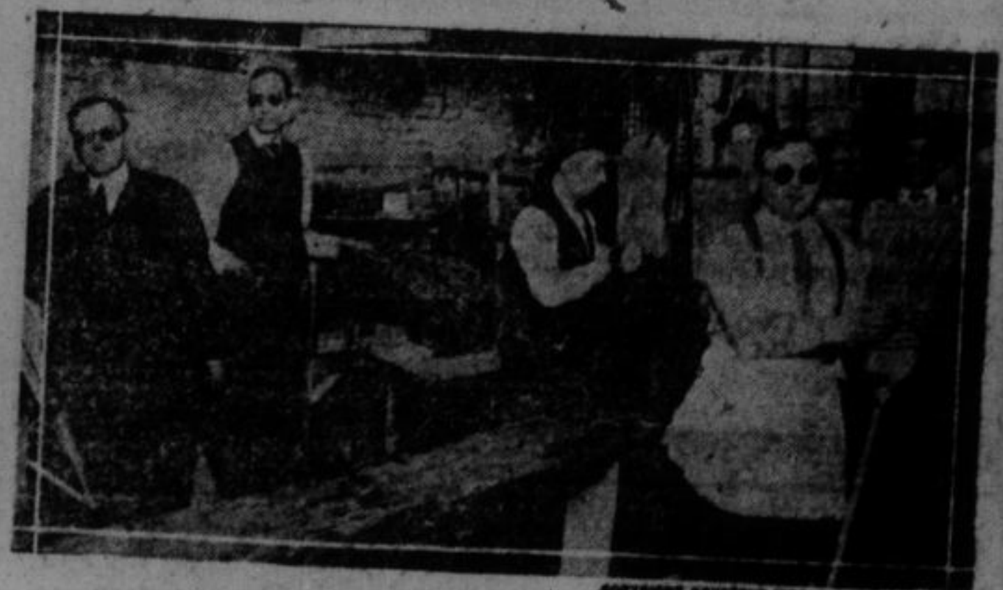
A. F. OF L. ESTABLISHES A BROOM FACTORY

Woman's most effective weapon is her beauty, and the modern woman with that thought well in mind, seeks all manner of ways to make herself more attractive. One of the many ways of preventing wrinkles is by wearing a mask while sleeping. The hands are also encased in heavy gloves and a stiff support is given the chin to prevent its multiplying itself.