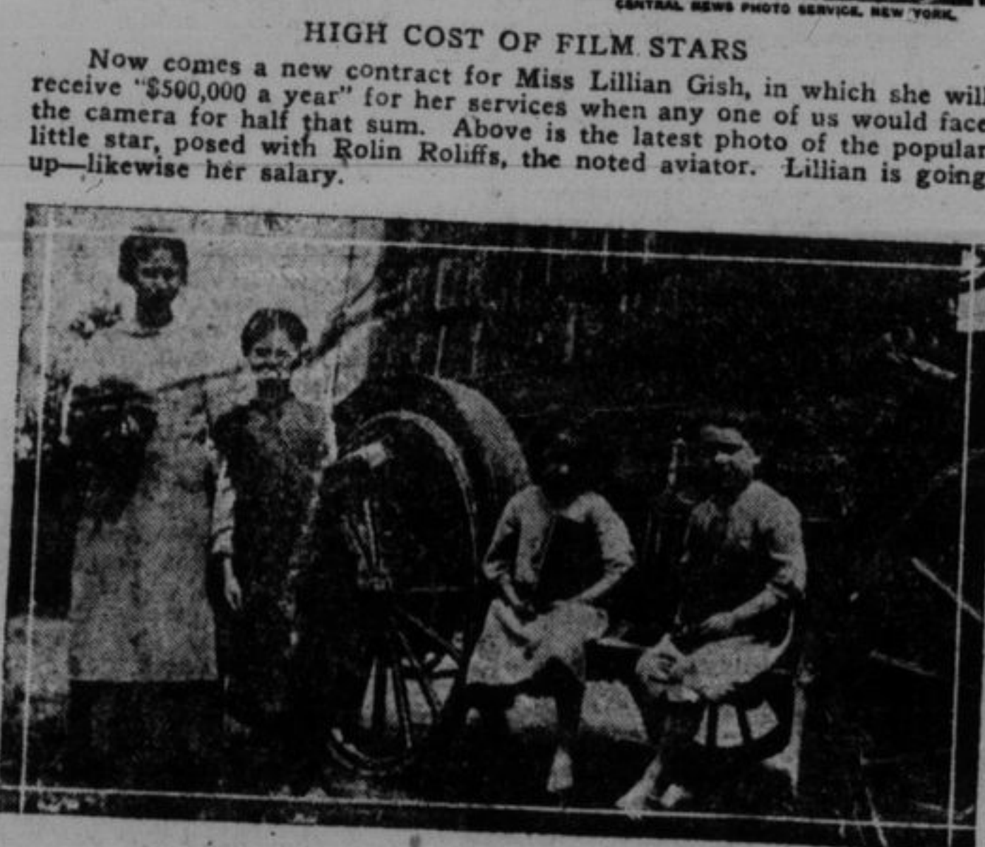
HIGH COST OF FILM STARS