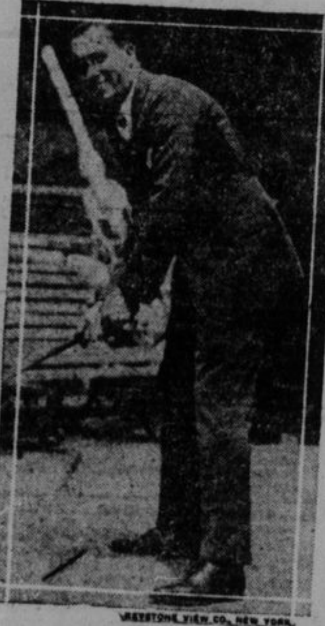
OPEN GOLF CHAMPION OF UNITED STATES