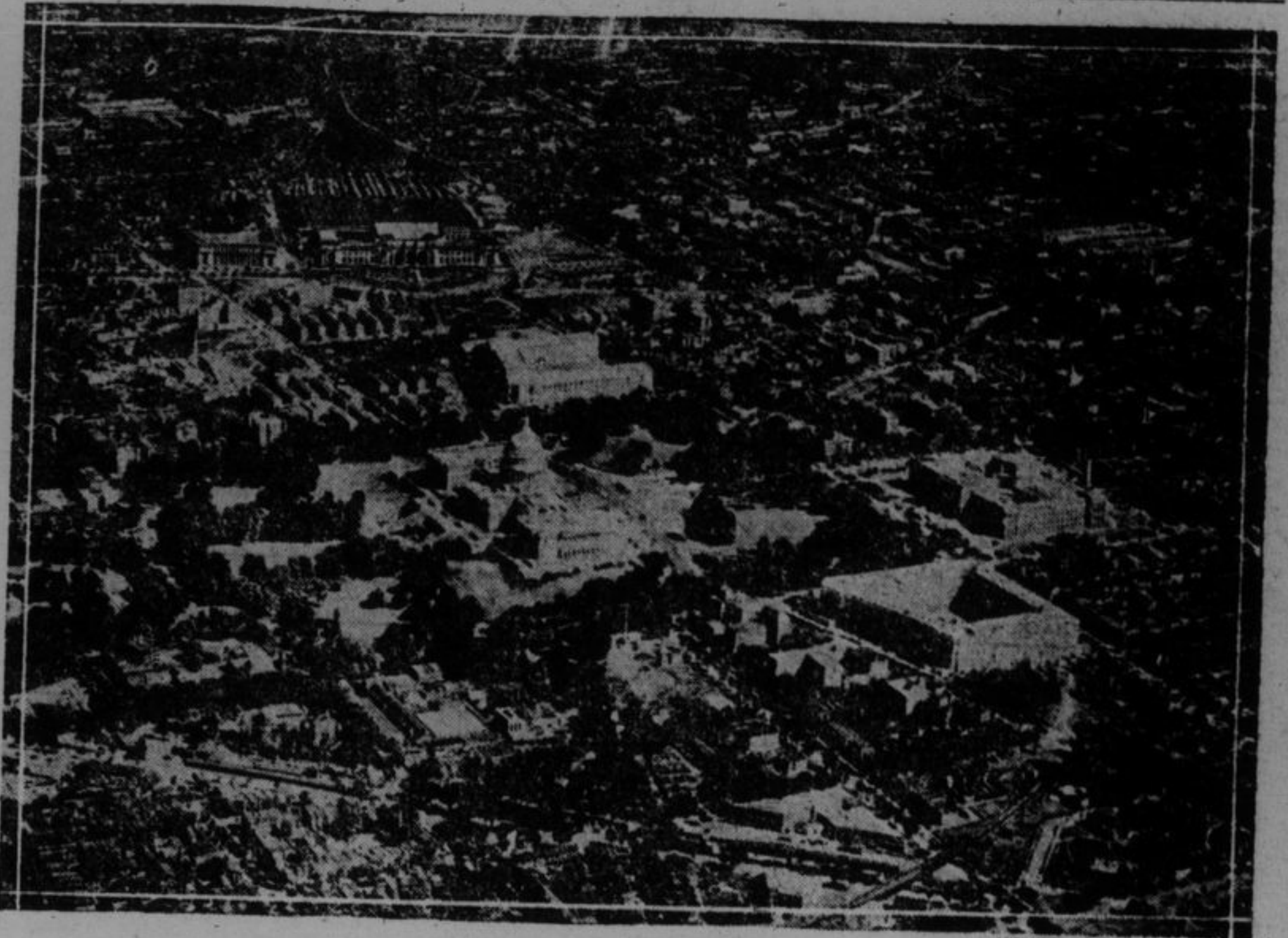
AERIAL VIEW OF THE CAPITAL A comprehensive view of Washington. The capitol, Congressional Library, Senate and House Office buildings and Union Station are plainly shown.