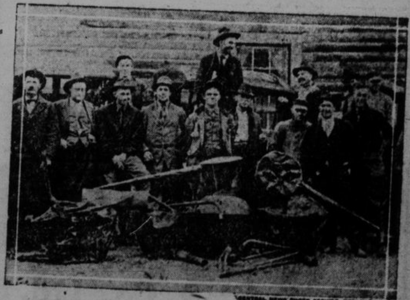
MOONSHINE RAIDS IN GEORGIA

Walter Hagan, open golf champion of the United States, who recently sailed for England, where he will meet her best golfers on their own links in the open golf championship tournament of Great Britain.