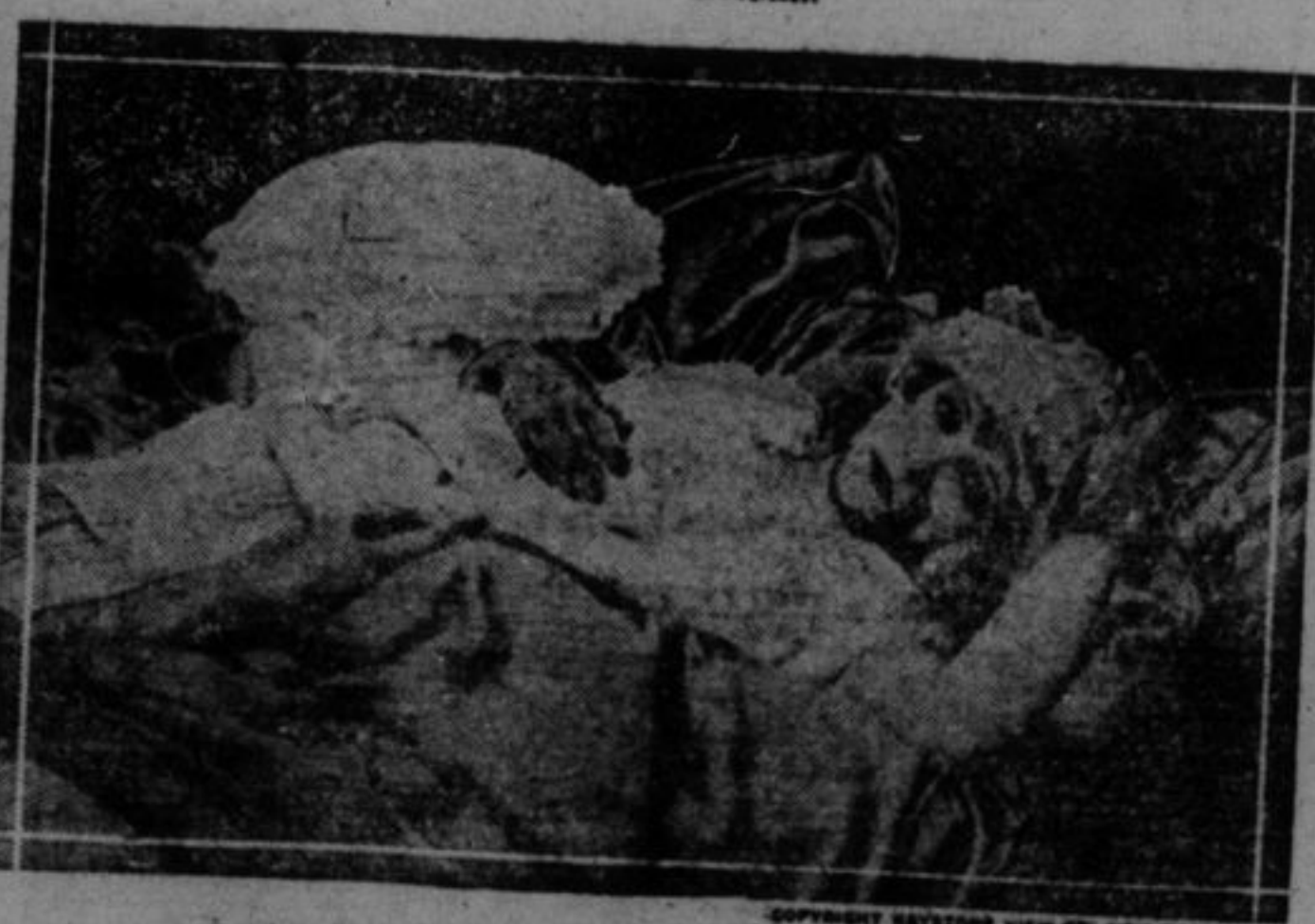
LUXURIES OF THE MODERN BEAUTY

Into the remote sections of many States goes the sturdy little book wagon, carrying the best of reading material to the rural dwellers who are outside the radius of the public library. It is one of the projects strongly promoted by the American Library Association in its "Books For Everybody" movement to extend library service to the 50,000,000 persons inadequately served.