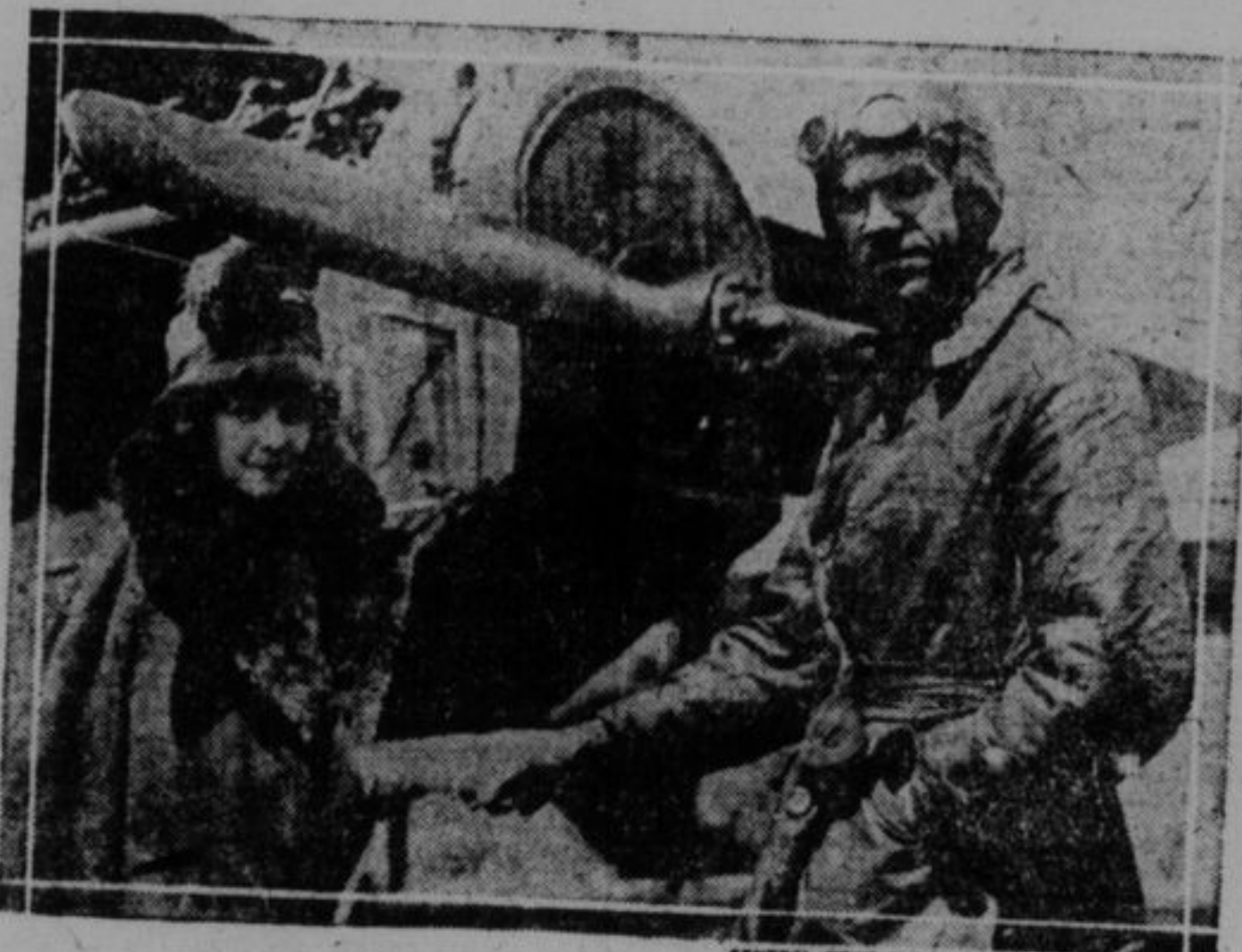
JOHN PHILIP SOUSA AS A TRAPSHOOTER

So scarce and valuable have chickens become in Germany that a family rich and lucky enough to own a hen or two give the birds every care and attention and guard them as closely as a national bank watches its cash. During the daytime the egg-laying pets are taken out for air, exercise and stray crumbs in leash. The photo was taken just outside Berlin.