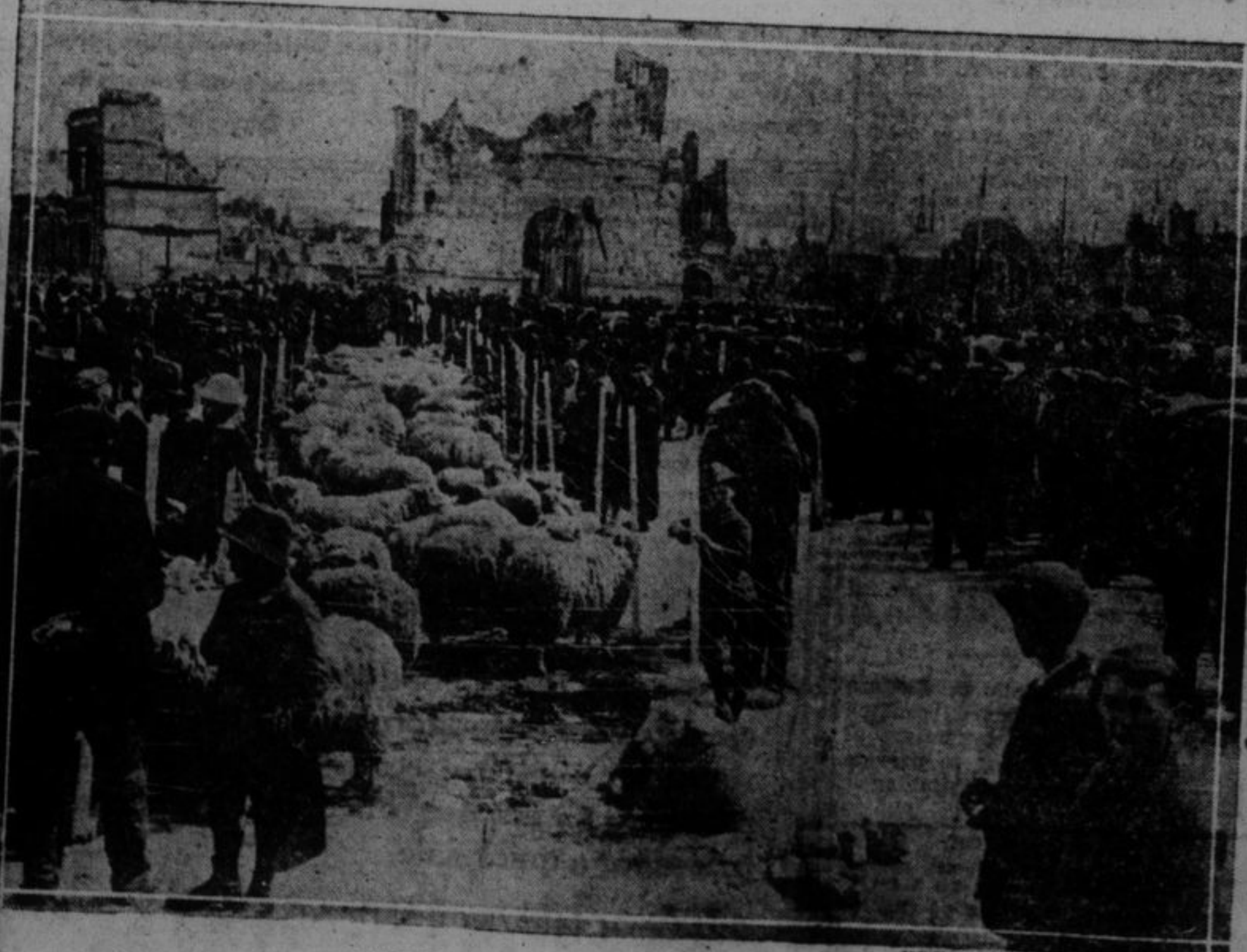
CATTLE SHOW IN YPRES, BELGIUM

Recent moonshine raids in Northern Georgia by U. S. Revenue Officers resulted in the capture of a score or more of moonshiners, who in some cases were caught in the very act of working their "stills." Photo shows a few "stills" and the revenue officers.