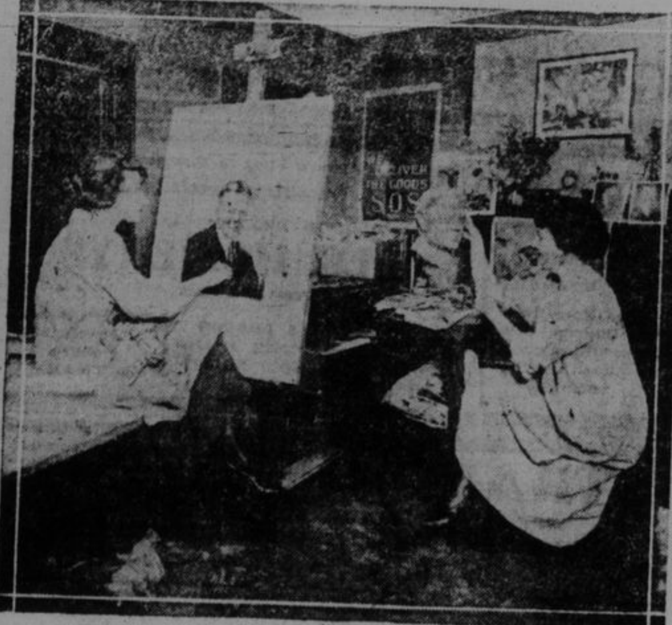
HOOVER BEING IMMORTALIZED BY TWO WELL-KNOWN WOMEN ARTISTS

Neysa McMein, whose magazine covers are admired throughout the United States is seen at the left making a clever portrait of the man who may be the Republican candidate for U. S. President. At the right Sally Farnham is putting the finishing touches to a life-like bust of Mr. Hoover.