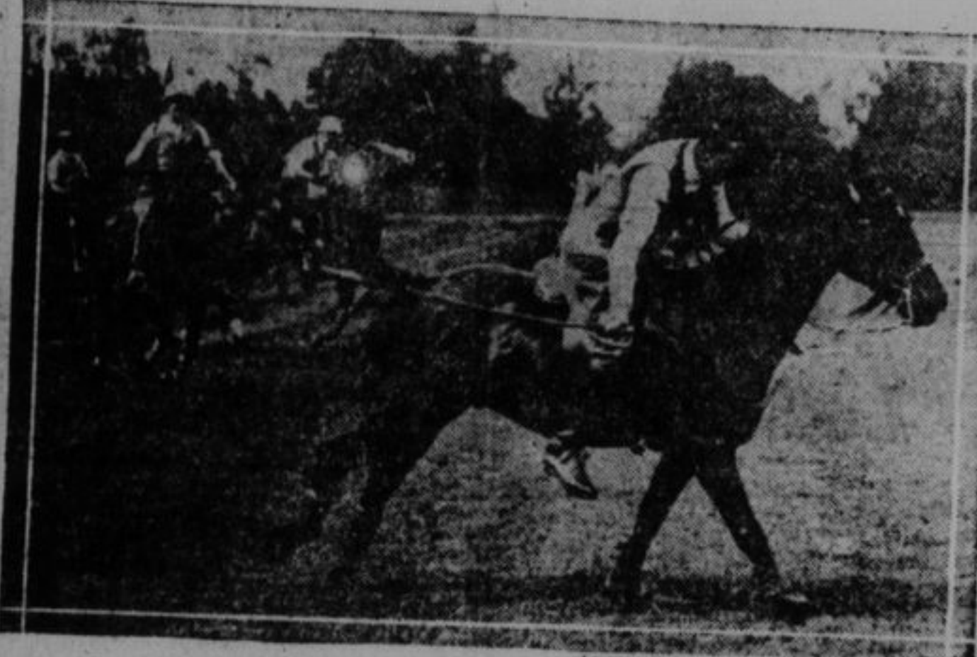
HEADS ENGLISH POLO TEAM TO INVADe AMERICA

Lipton's challenger for the America's cup, glistening in a brand new coat of green paint and wearing a full dress of pennants, streamers and signal flags slipping gracefully off the ways at City Island, New York, May 26th.