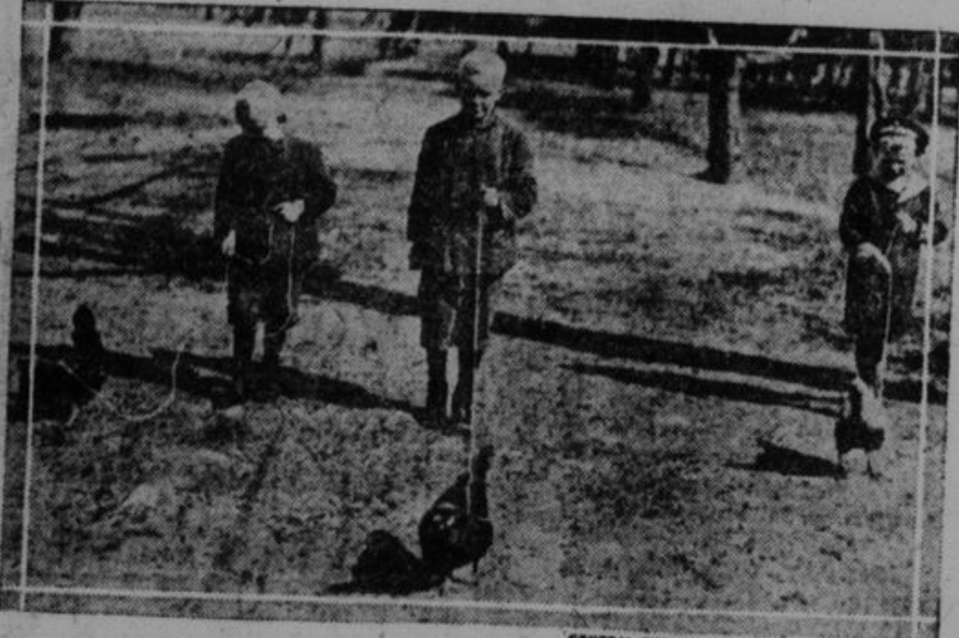
A NEW OUTDOOR SPORT FOR BERLIN YOUNGSTERS

So scarce and valuable have chickens become in Germany that a family rich and lucky enough to own a hen or two give the birds every care and attention and guard them as closely as a national bank watches its cash. During the daytime the egg-laying pets are taken out for air, exercise and stray crumbs in leash. The photo was taken just outside Berlin.