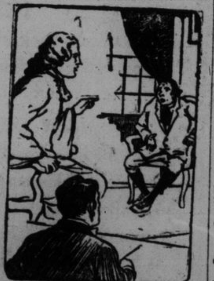
"Your Share of It!"

When he began the practice of law, O'Connell happened to be the