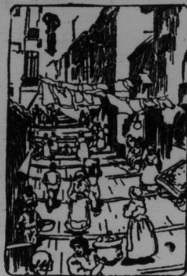
A "Step Street" in Naples.

You enter this store and make your purchases on the first floor. Perhaps you wish to buy something which is on the next floor, or perhaps you are smilingly directed to an interesting way to leave the shop. Up a short flight of stairs you go, then you are directed to another flight of steps, and still another. You are always going up. Yet when you leave you find yourself departing through the door by which you entered, although you have climbed several flights of stairs.