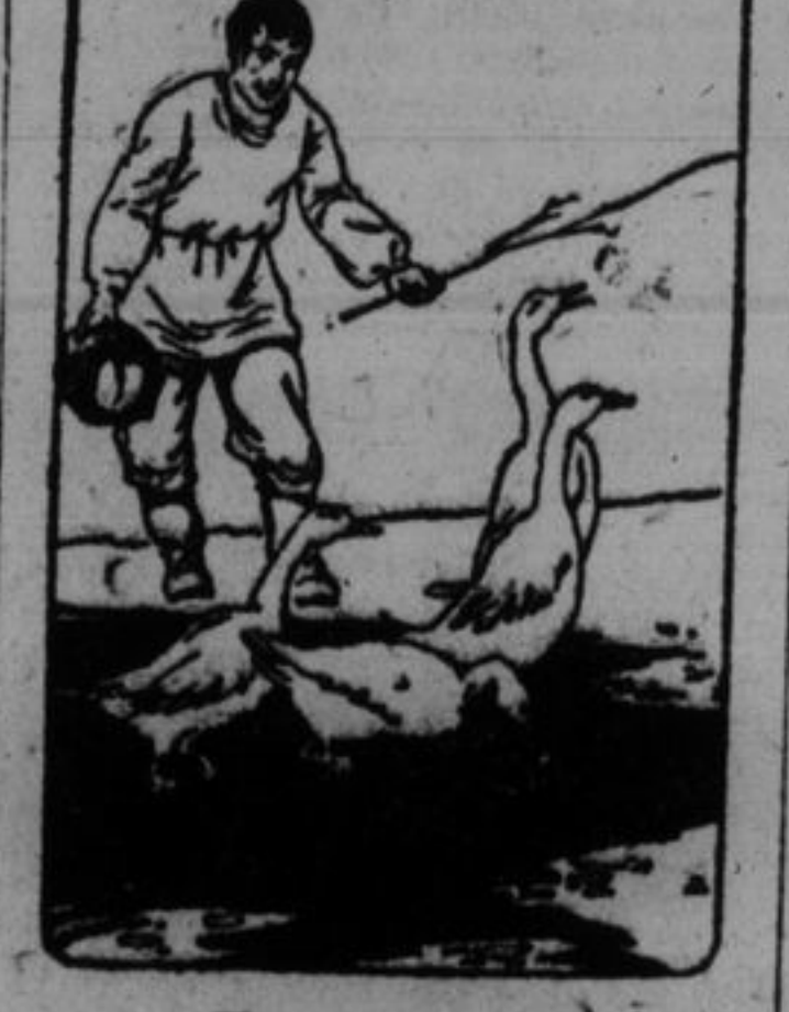
Through the Tar.

geese have been walked to Warsaw, their owners discovered that the geese lost weight on the walk, and arrived at their destination with sore feet, which reduced their value. So some clever goose fancier hit upon the scheme of having his geese shod. They arrived at Warsaw in such good condition, and fetched so satisfactory a price, that their owners decided to follow the first breeder's scheme.