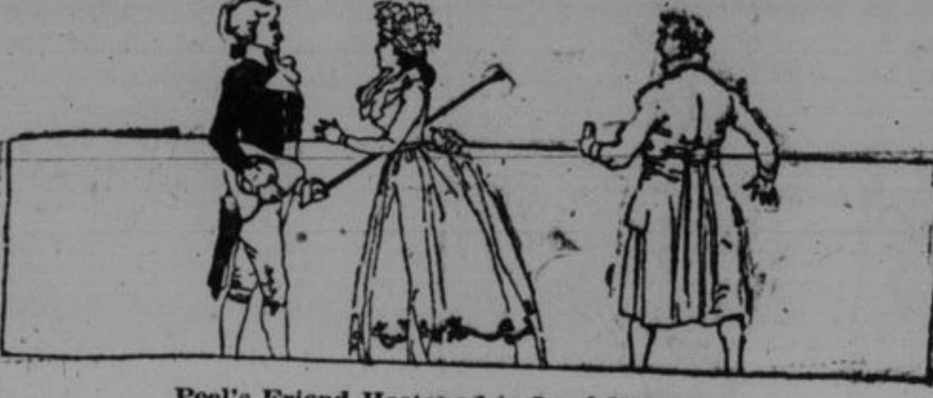
Peel's Friend Hastened to Lead Him away.

They pushed their way through the crowd, and as soon as he had watched the card manipulator a while, Peel turned to his friends and said: "The poor man is a sad bungler. He can't do the trick at all."