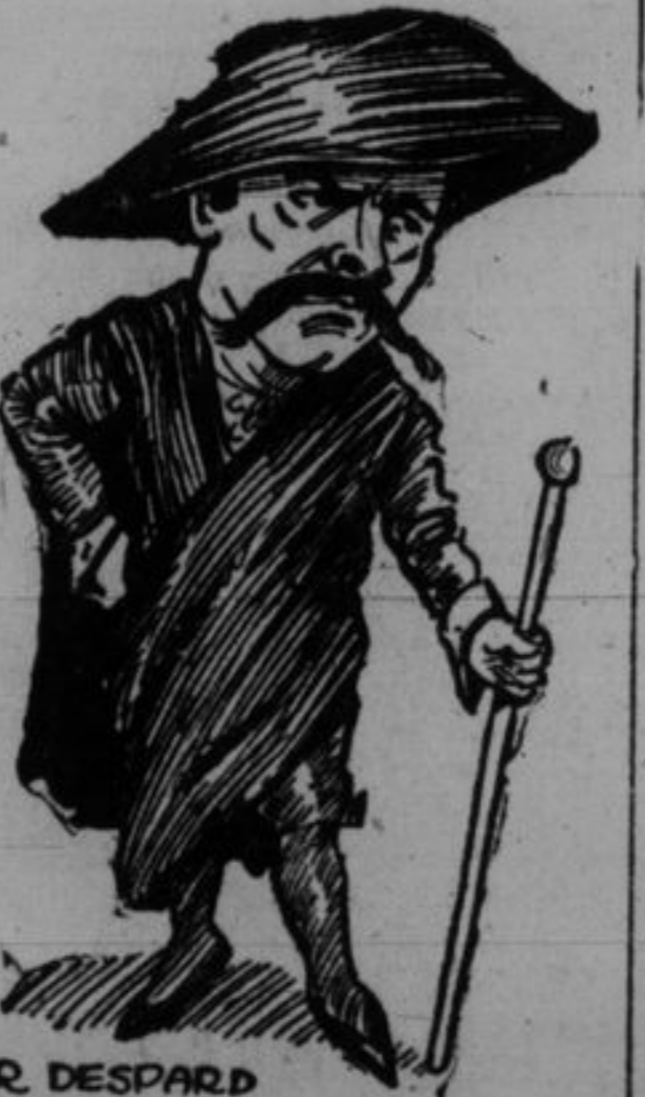
SIR DESPARD THE WICKED BARONET In the Brilliant Comic Opera "Ruddigore."