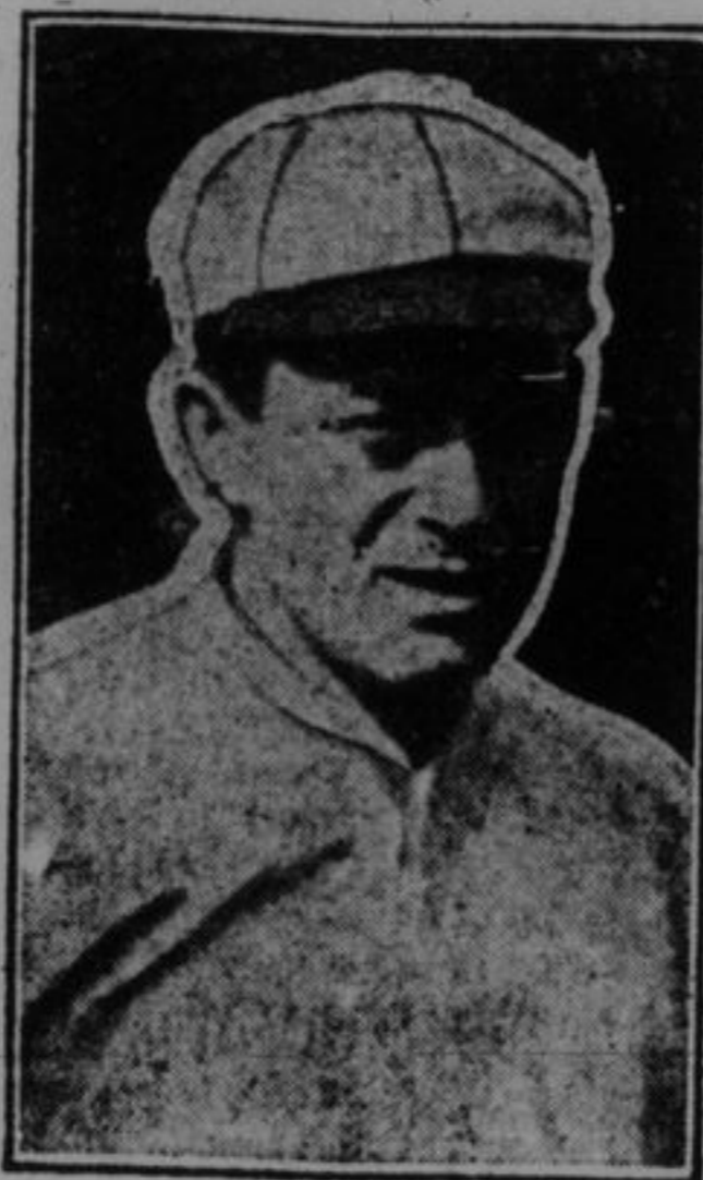
The fight for the American League championship this year will be between the New York Yankees and the Cleveland Indians, according to Miller Huggins, who, incidentally, is piloting the Yankees.

Northern Union. Lakefield 5, Batley 5. Hull Kingston 2, Bradford 2. York 2, Halifax 11. Keighley 7, Hull 8. Leigh 0, Rochdale 5. Oldham 12, Salford 3. Dewsbury 10, St. Helen's Rec. 5. St. Helens 15, Warrington 2. Broughton 5, Wigan 6. Hunslet 17, Bramley 0. Barrow 3, Huddersfield 30. Widnes 0, Swinton 0. Other rugby games resulted: Aberavon 5, Swansea 0; Black Heath 17, Oxford University 47; Cambridge University 47, London University 5; Cheltenham 8, Bristol 18; Gloucester 12, Newport 9; Headingly 13, Liverpool 0; Llanelli 13, Leicester 3; Richmond 29, London Scottish 0; Rugby 6, Northampton 13; United Services 0, Cardiff 3.