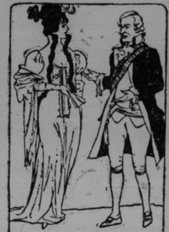
"There is the Only Caricature That Has Ever Caused Me Annoyance."

"Only tell Bony that I hope he finds his old lodgings at Longwood