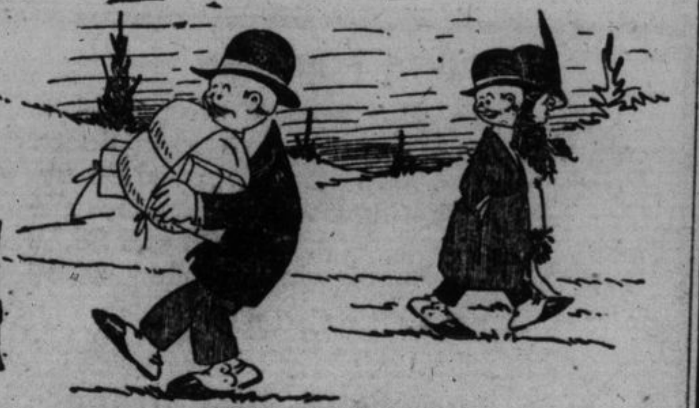
WELL CONCEALED She: Looks like dry goods of some sort for his wife's Christmas. He: It sure does, but I happen to know it's wet goods for his own Christmas.