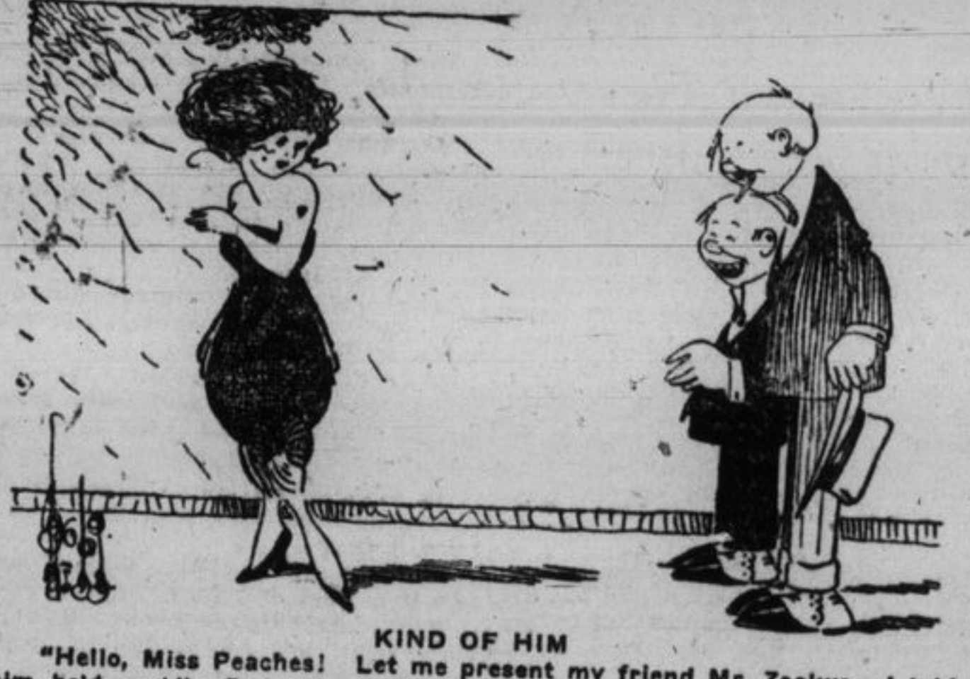
KIND OF HIM "Hello, Miss Peaches! Let me present my friend Mr. Zookus. I told him he'd probably find you under the mistletoe, and I gave you a good reference."