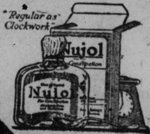
"Regular as Clockwork"

The Modern Method of Treating an Old Complaint