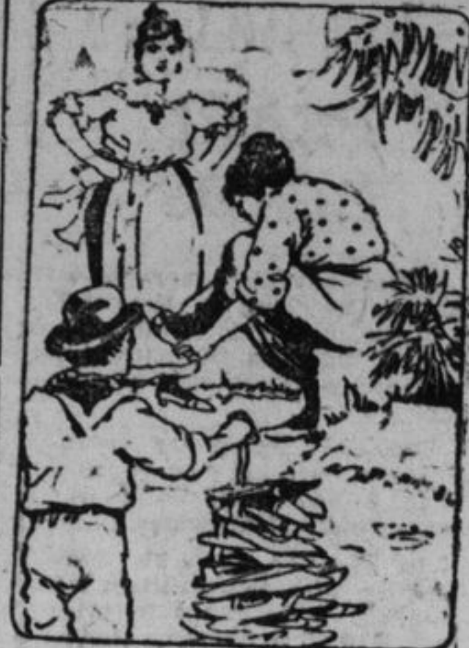
Being "Fitted" Unconventionally.

wants to buy a new pair of shoes she doesn't go down this thoroughfare to shop. The chances are that she won't go anywhere to make her purchase, but will wait until a boy comes along her own street with several dozens of pairs of "smanacco"—or wooden shoes—from which she will select a pair her size.