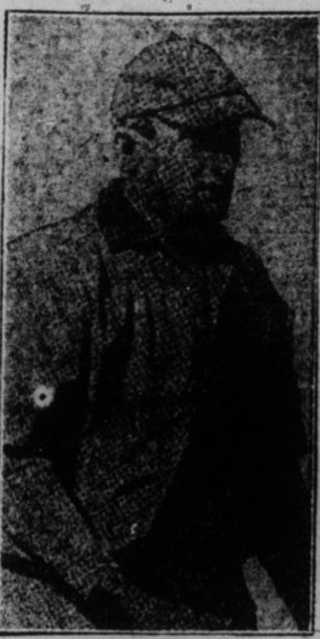
HONUS WAGNER For twenty-one years star short-stop of the Pittsburgh Pirates, who is mentioned as a possible manager of the Philadelphia Nationals next season.

Boston women have become ring-side fans, judging from the reports that nearly 200 of the fair sex witnessed one of the recent fight shows in the Hub.