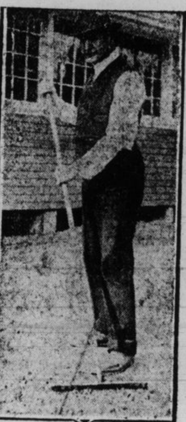
SIR ADAM BECK AT HOME. An unusual photo of the Chairman of the Ontario Hydro-Commission, showing him wielding the garden rake at his home in London, Ont.

The manager will submit at the next meeting of the commission a report as to the cost of doing the necessary underground work in streets that the Board of Works wishes to pave next year.