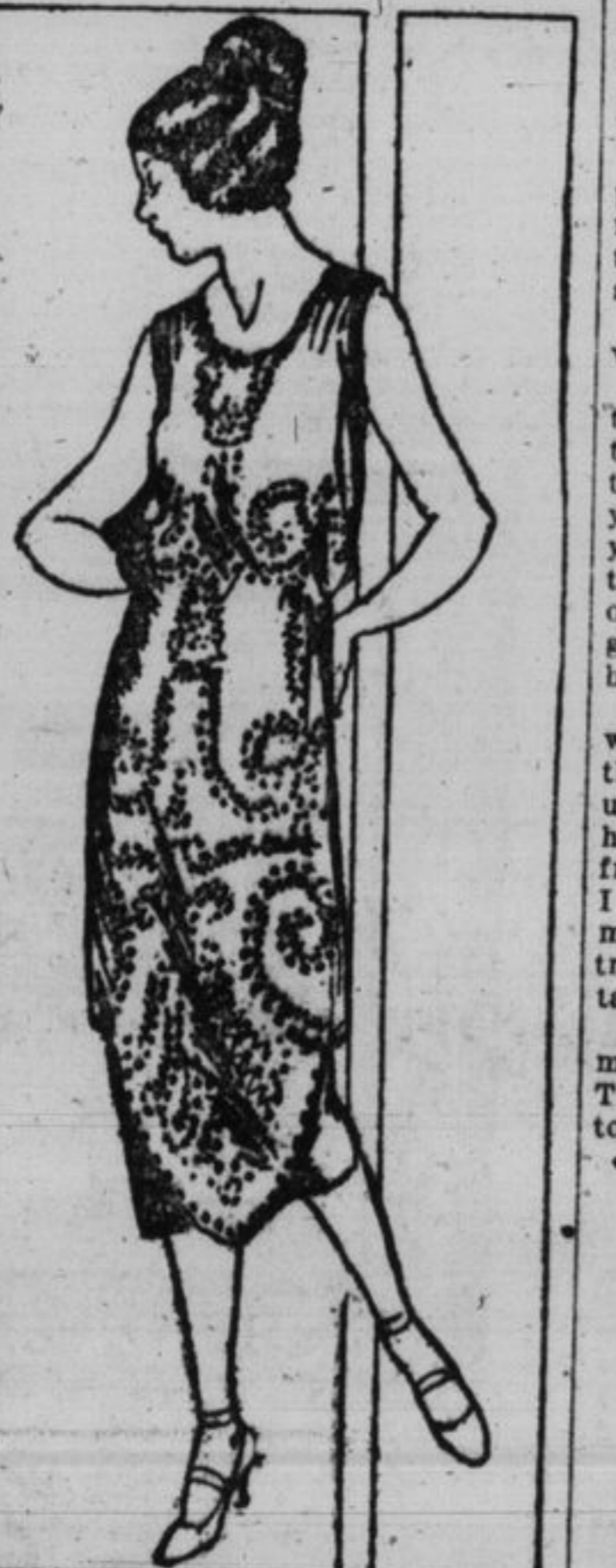
Beauteous Chemise Dress Embroidered in Red, Bright Blue and Copper.

Very unusual are the things used to work out embroidery designs. A chemise frock of satin has the entire