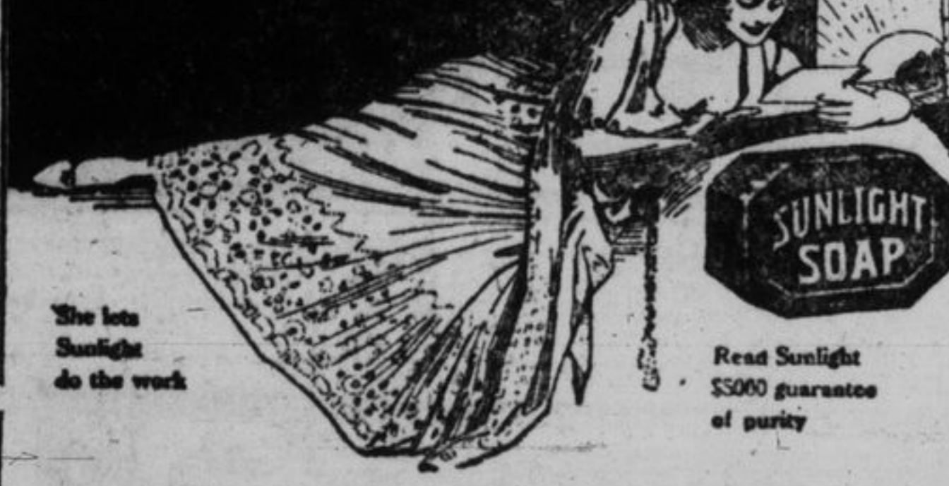
She lets Sunlight do the work