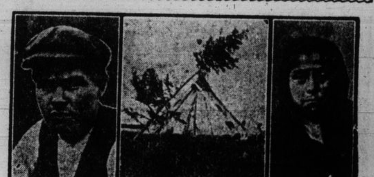
NATIVE BEAUTIES OF THE NORTH. The man and the woman shown above were picked by the natives to win the beauty prizes offered by the Hudson Bay Co., at the celebration of the 250th anniversary of the company. A tree cut so as to fall toward a hut, with the foliage cut out from the centre (shown in the picture) indicates that the family in the hut are starving.