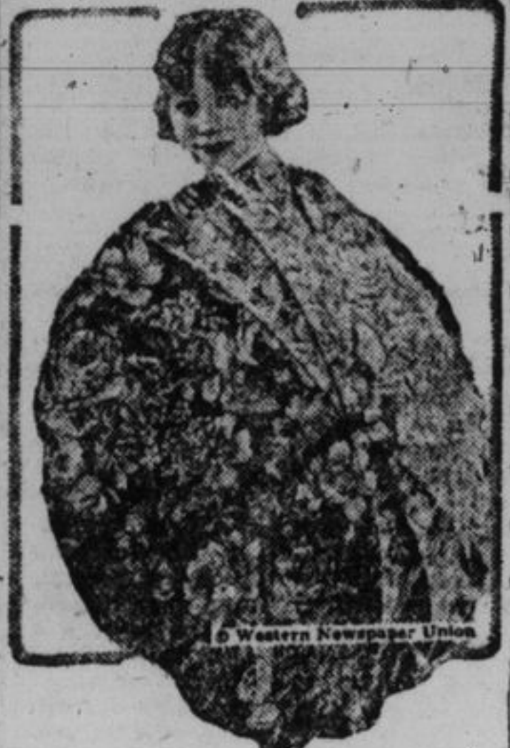
Cretonne Parasol in Bright Rose, Blue, Yellow and Green.

Gaily painted paper is used in summer parasols. Taffeta and cretonne, always prominent in these, are used probably more than any other materials, although for the country there are sunshades of calico, pongee and even glazed paper painted in gay designs, observes a writer of fashion articles. Brown is still the fashionable color for umbrellas, but in sunshades we see