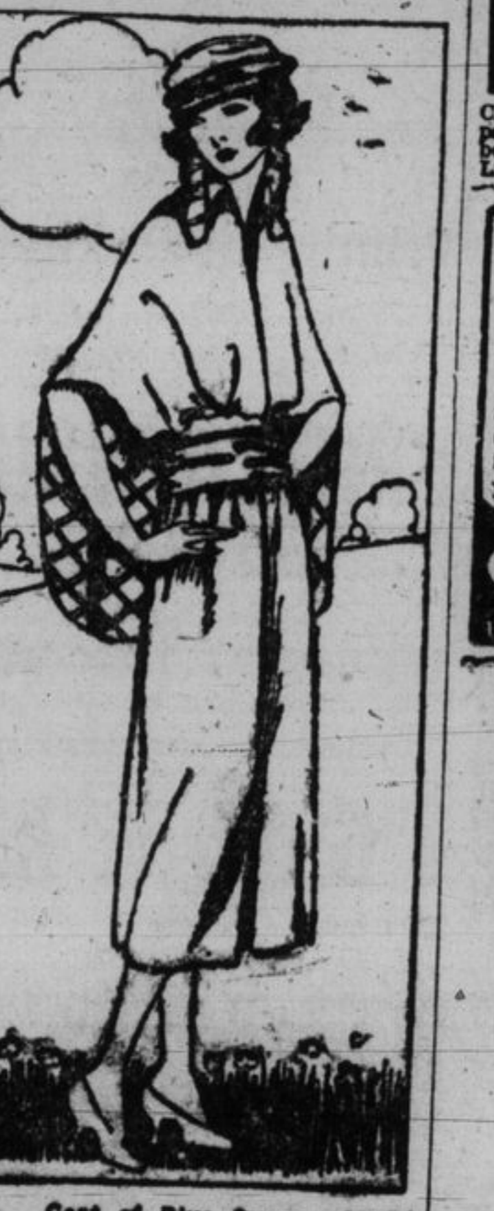
Coat of Blue Serge.

continues down the entire length of the front at either side. The angora appears again in the form of tabs protruding from the side seams as well as in large patch pockets.