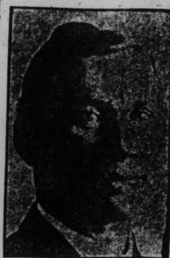
HUGHIE JENNINGS Of "Ee-yah!" fame, has completed his last year as manager of the Detroit Tigers, and will probably serve as a coach for the New York Giants next season.

Heydler Hopes for Peace. Hope for peace in place of the threatened baseball war was expressed in New York by John A. Heydler, president of the National league, and leader of the forces seeking the abolishment of the national commission. "Details of the twelve-team league have not been worked out," he said. "We consider it premature, as we are confident that the five American league clubs will join us. However, if it becomes necessary to organize a twelve-team league it will work in a season or two." It was reported here that Baltimore was getting ready to make a formal application to the National league officials for a franchise in the proposed new league. In Persia the dough for making bread is rolled out as thin as a pancake, and as long as an ordinary towel.