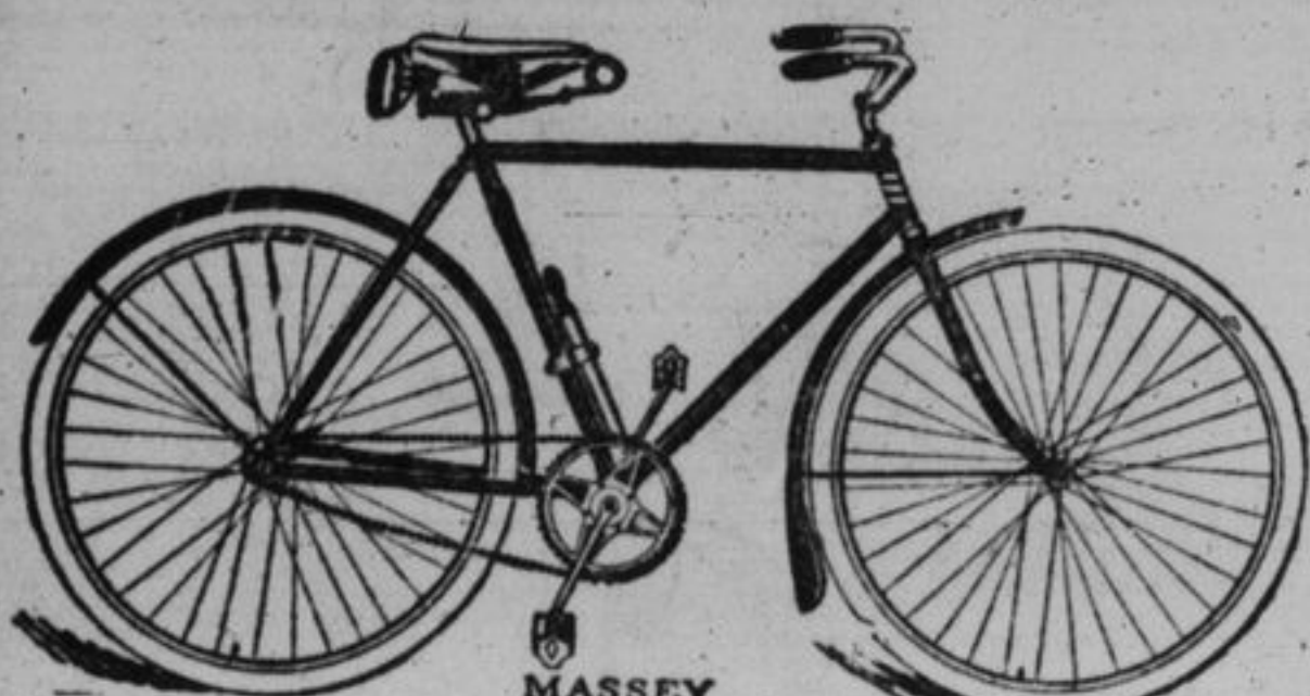
MASSEY The Best Bicycle Made—Costs No More Than Others

A Bicycle does not require much care to keep in storage for the winter so don't bother with that. Come in and have us fit you up. Easy terms if desired.