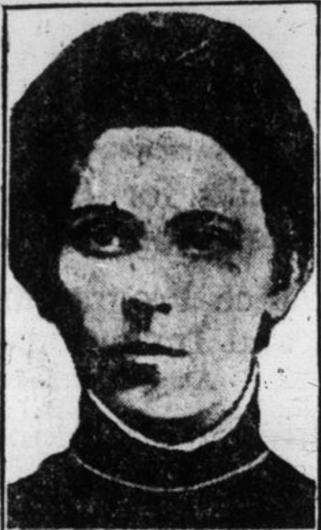
MARIA SPIRIDONOVA One of the leaders in the overthrow of the Russian monarchy, who is now heading the peasants' movement against the Soviet Government.